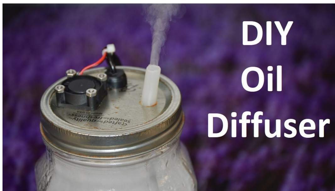
The Ultimate Guide To

One crucial note about vital oil diffusers is that, in general, they are extremely much better than the conventional use of candles for vital oil diffusion. Candle lights tend to drown the fragrance of vital oils with their own wick-based scent. Therefore, it defeats the spread of the health benefits of essential oils.