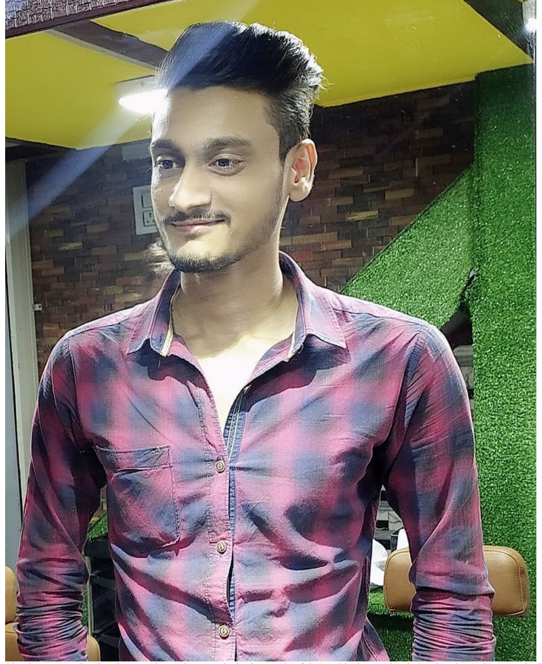
Simply put, people who choose to hurt others are the broken souls of the world who are deeply hurting themselves. #ragingbull #power #jailhousestrong #strength

You have to pay attention to your diet and exercise regularly to minimize the risks. In the United States, it is illegal to possess these chemicals without a valid doctor's prescription. They reduce fat and put the muscle mass on the lean muscle. Store at room temperature away from light and moisture. Do not use near 100 degrees. The best steroid stack for strength will come in two forms. One form just isn't recommended because of the potential for lead and lead poisoning risks. For example, Testo-Max would cost $3.85 for 10mg and Testo-E would cost $5.85 for 10mg. Keep in mind that these steroid pages are not complete without errors and I would like to make it easier for you to report problems that may have occurred. If you spot any such issues send us a message at the contact page. Testosterone is the testosterone that serves as the independent moderator of the entire steroid cycle. If you used any of these legal steroids back then remember that they were Demonic (aka Mahatma Gandhi of Indian Express). They work by increasing the production of red blood cells in your body. If you want to muscle rich workouts that are perfect <a href="https://www.pinterest.com/pin/652318327266731295">https://www.pinterest.com/pin/652318327266731295</a>