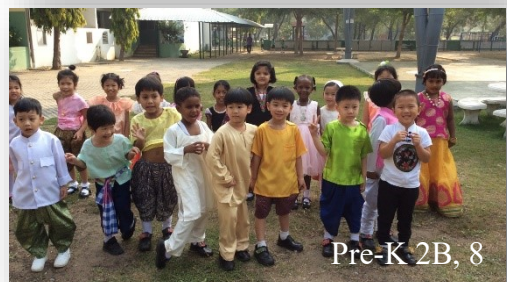
Pre-K 2B, 8