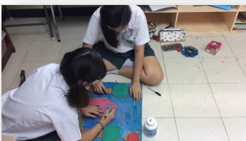
Math Activity by Grade 5