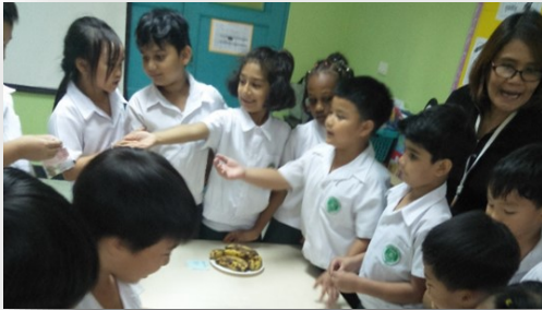
Math Activity by Grade 1