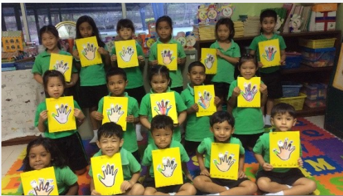
Kindergarten Jolly Kittens are learning about the sense of touch. They did an arts and crafts of a hand showing the different texture like smooth, rough, hard, soft and sharp.