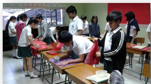
Science Activity by Grade 6