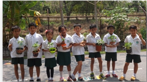
Science Activity by Grade 2