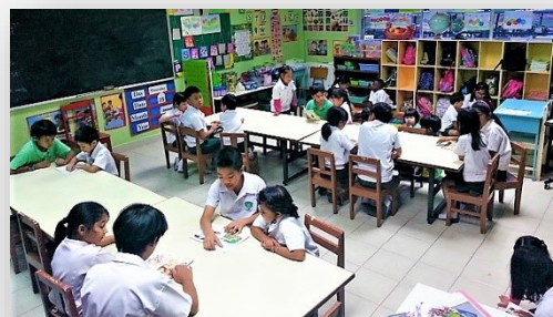
The KG-B students are being read a story by the Graders students.