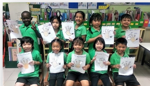
The KG Dynamic Dolphins are learning about their sense of touch and feel. They made a hand of textures to help them identify rough, smooth, hard, soft and crinkly.