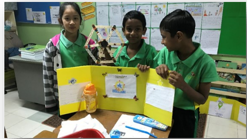
Science Activity by Grade 3