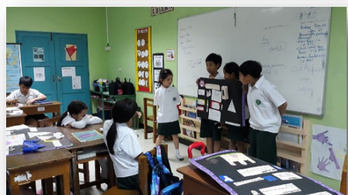
Social Studies Activity by Grade 4