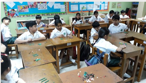
Science Activity by Grade 4