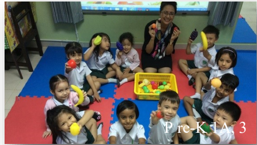
Pre-K 1A, 3