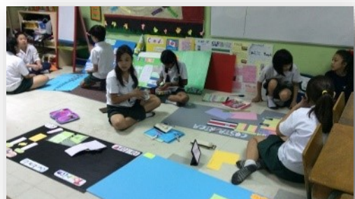
Social Studies Activity by Grade 5