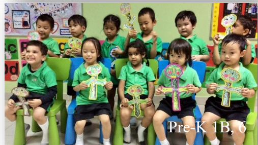
Pre-K 1B, 6