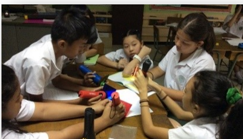
Science Activity by Grade 5