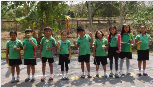
Science Activity by Grade 2