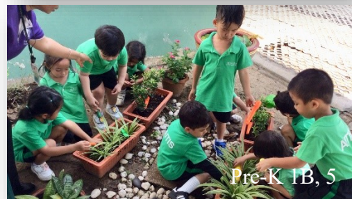
Pre-K 1B, 5