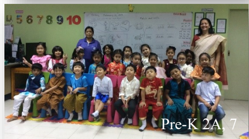
Pre-K 2A, 7