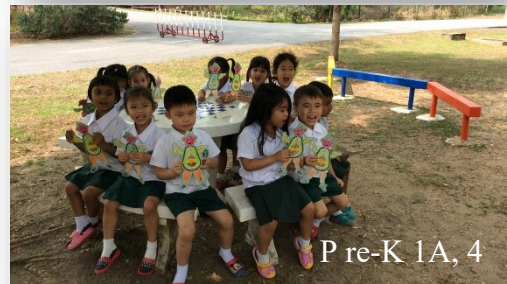
Pre-K 1A, 4