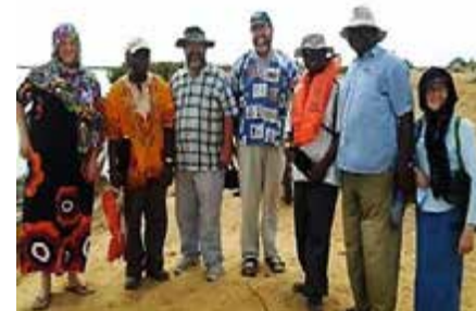
Ministry team 2013 about to visit a Muslim village across the river in Chad.

Years later, in 1996, I was teaching at the English-teacher training college in Bunia in eastern DRC when Laurent Kabila invaded the country from the east, and took over from President Mobutu. AIM missionaries were evacuated from the country, crossing over into Uganda by car. Less than two years later, we had to evacuate again due to civil unrest and violent inter-tribal conflict in Bunia. This time, AIM-AIR pilots rescued us at a small airstrip near town and flew us to Nairobi, and I worked there for a few months before returning to Canada.