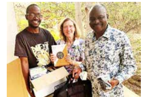
2019 The director and librarian of Nassa Theological College receive computer & books from Canada.

Looking to the future, I know that my times are in God's hands, and that's the best place they can be!