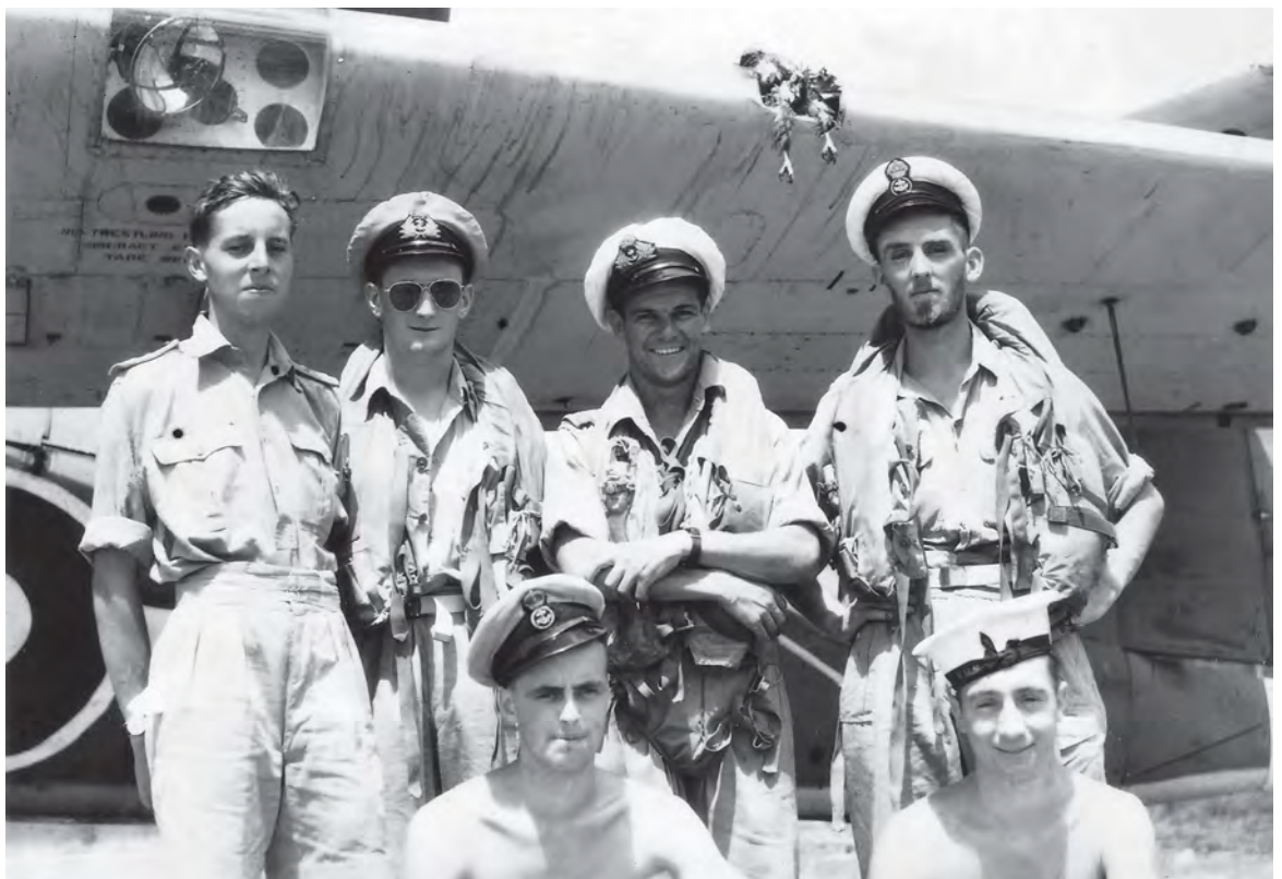
RIGHT: Members of 814 Squadron, now in tropical gear, pose in front of a birdstrike on an 11th ACS Barracuda in 1945, apparently a large raptor which could have done significant damage had it hit somewhere more vulnerable.

In fact, most of the Fleet Air Arm squadrons with the 11th ACS were ready before their carriers. The