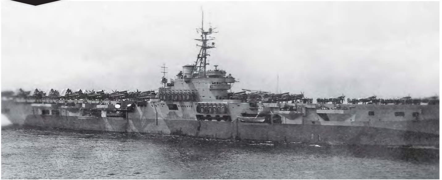
ABOVE: HMS Vengeance at Gibraltar during the 11th ACS's long voyage east. On deck are the Barracudas of 812 Squadron and the Corsairs of 1850 Squadron, as well as some Seafires or Spitfires, possibly for delivery in the Mediterranean.

collided with a Barracuda flying beneath it. The pair crashed into the sea, and the pilot and TAG (telegraphist-air gunner) in the upper cockpit of the lower aircraft, and the entire crew of the upper one, were killed instantly. The observer, slightly better-protected within the fuselage of the former machine, survived. This was Sub-Lt Sagg, a former Cambridge scholar, who was seen by the remaining aircraft to climb out onto the wing before collapsing. He was picked up by a rescue boat, and described as being "black and blue". The squadron never saw him again and it was assumed that he had died — in fact, he survived, but had broken his back and would not be fit to fly in time to re-join the