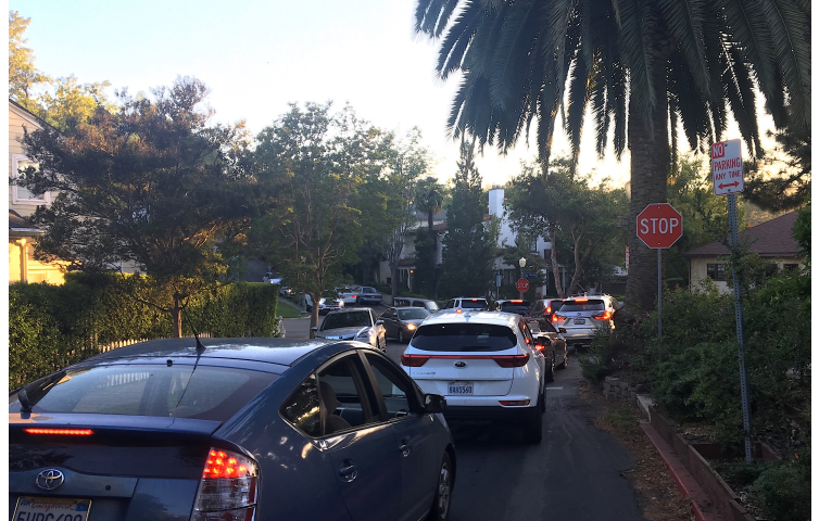
HKCC is working with L.A. City officials to correct this kind of car jam as La Suvida and Primera merge into Lake Hollywood Drive headed down to Barham Blvd.