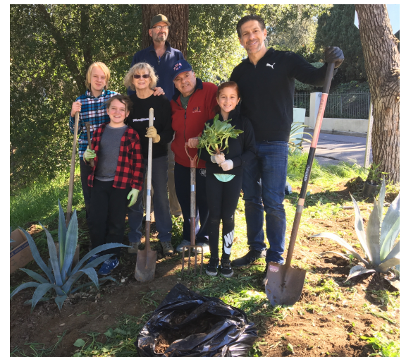
"Succulent Saturday" at the Triangle property on Lake Hollywood Dr. and North Knoll Dr.