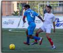
Day 2: Let the games begin!