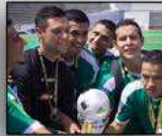
Day 3: Moment of truth - the Final