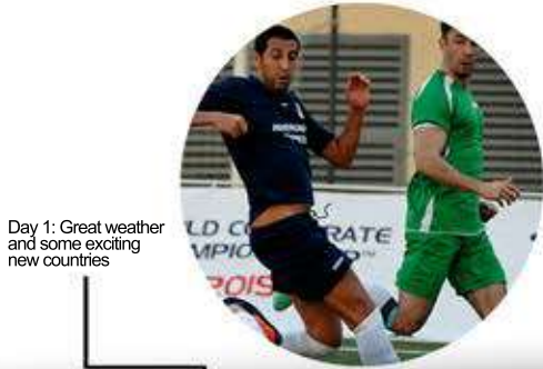
Day 1: Great weather and some exciting new countries