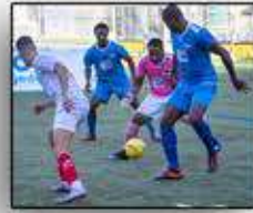
Day 3: Who will win this year?