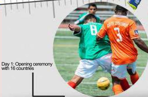
Day 1: Opening ceremony with 16 countries