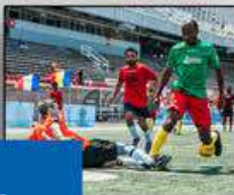
Day 2: Competition begins in a tense rivalry