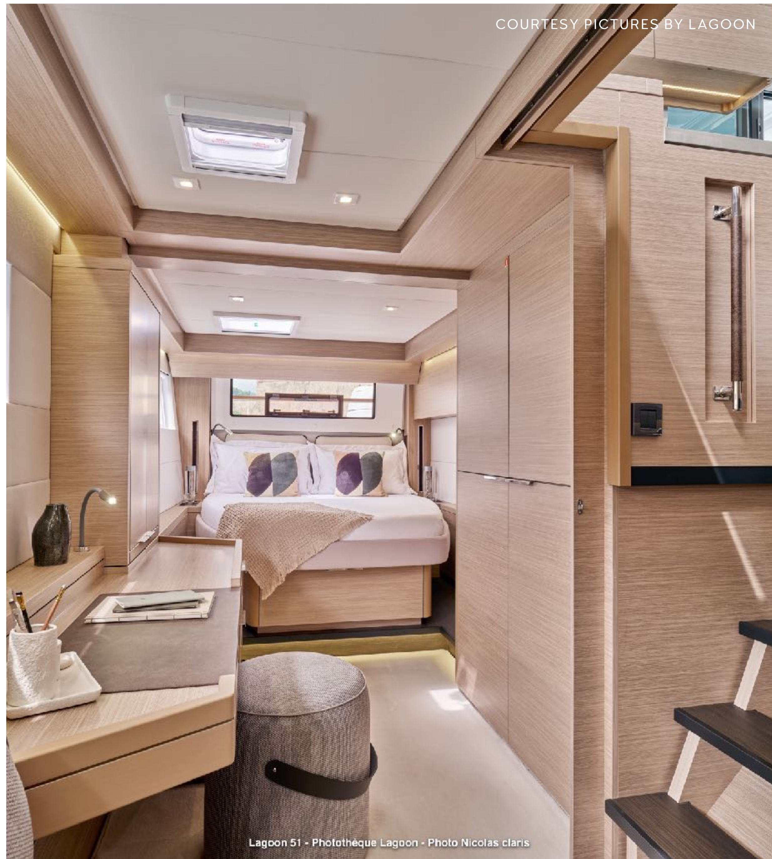
Lagoon 51