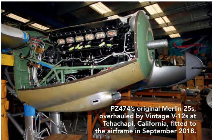
PZ474's original Merlin 25s, overhauled by Vintage V-12s at Tehachapi, California, fitted to the airframe in September 2018.