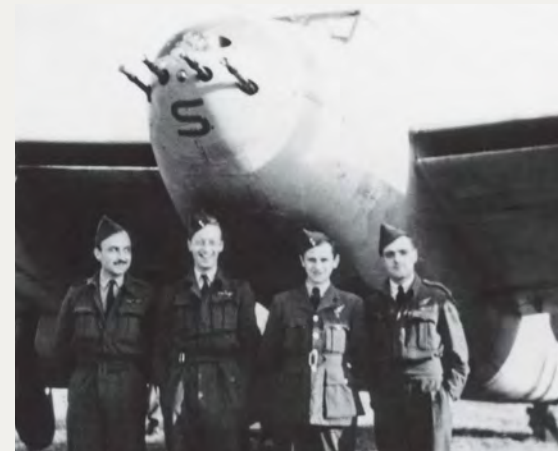
Mosquito FBVI HR137/3-S of No 235 Squadron with two (sadly unidentified) crews at Portreath during the summer of 1944.

Another shipping escort led by Yonge in HR127/D on 21 June brought a flurry of action. At 13.20hrs the joint patrol encountered a formation of Do 217s, probably from KG 100, carrying Hs 293 anti-ship guided missiles. Yonge immediately led the Mosquitos in to attack, and he combined with Fg Off Green flying 'J' to shoot one down. Fg Off Collins in 'A' and Flt Lt Passey in 'F' of 248 bagged another, ➤