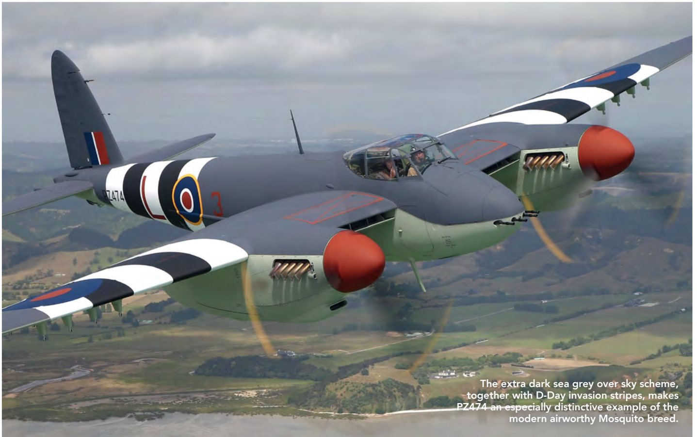
The extra dark sea grey over sky scheme, together with D-Day invasion stripes, makes PZ474 an especially distinctive example of the modern airworthy Mosquito breed.

To help counter Luftwaffe long-range fighters over the Bay of Biscay, the RAF stationed several long-range fighter squadrons of its own at bases in west Cornwall. Among these was the Beaufighter-equipped No 235 Squadron, which had been based at Portreath alongside No 248 Squadron. In early June 1944, under the command of Wg Cdr J. V. Yonge, it was re-equipped with Mosquitos. Along with 248 under Wg Cdr Tony Phillips, which had been flying the DH type since late 1943, it formed the Portreath Wing — the first Mosquito strike wing in Coastal Command.