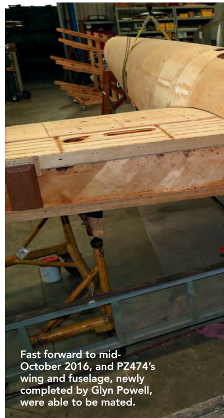
Fast forward to mid-October 2016, and PZ474's wing and fuselage, newly completed by Glyn Powell, were able to be mated.