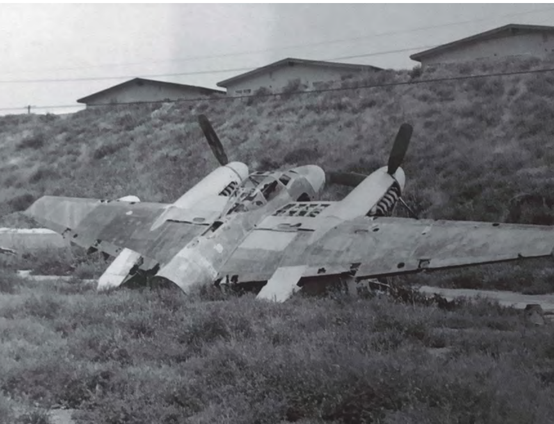
ABOVE: Cut in half behind the wing, the derelict Mosquito made an increasingly sorry sight at Whiteman Air Park as the 1970s progressed.