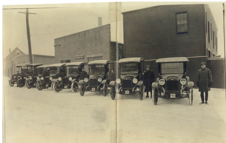
Historical Photo: The PWD garages on Kennebec Street.