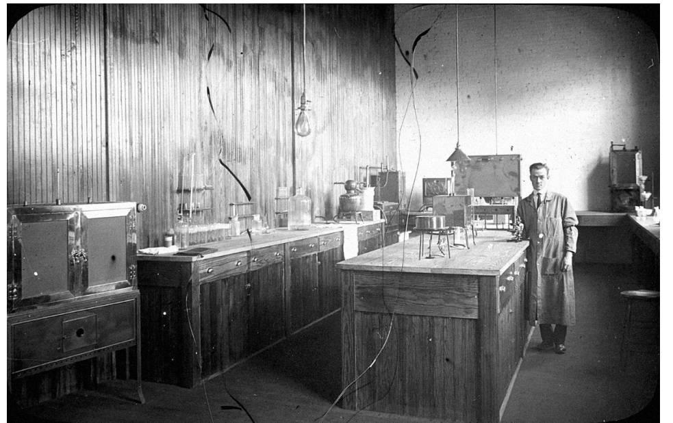
Historical Photo: lab worker in PWD building on Casco St.

Most Portlanders had no idea about the round-the-clock technical men—and women, too, as recorded in photos—earnestly plug-