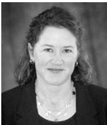
CITY COUNCILOR BELINDA RAY