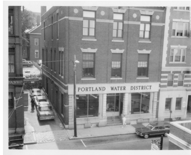
Historical Photo: The former PWD building at 16 Casco St. in West Bayside.

the second floor of 16 Casco St., home to the largest water company in Maine. And it all began because of typhoid fever and a tragic fire.