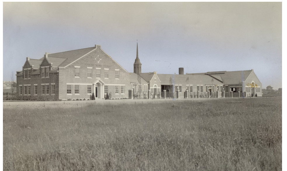
Historical Photo: The PWD's new digs on Douglass St. opened in 1926.

In 1907, the city obtained the charter of the Portland Water Company and created the Portland Water District to serve seven neighboring towns and five Casco Bay islands.