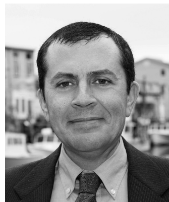
STATE REP. BEN CHIPMAN

Public comment is always taken on action items, and we try to leave time for public comment on other issues at each meeting. If you are unable to attend a meeting, you can always submit public comment by emailing one of the councilors on the committee or the city staff members assigned to the committee.