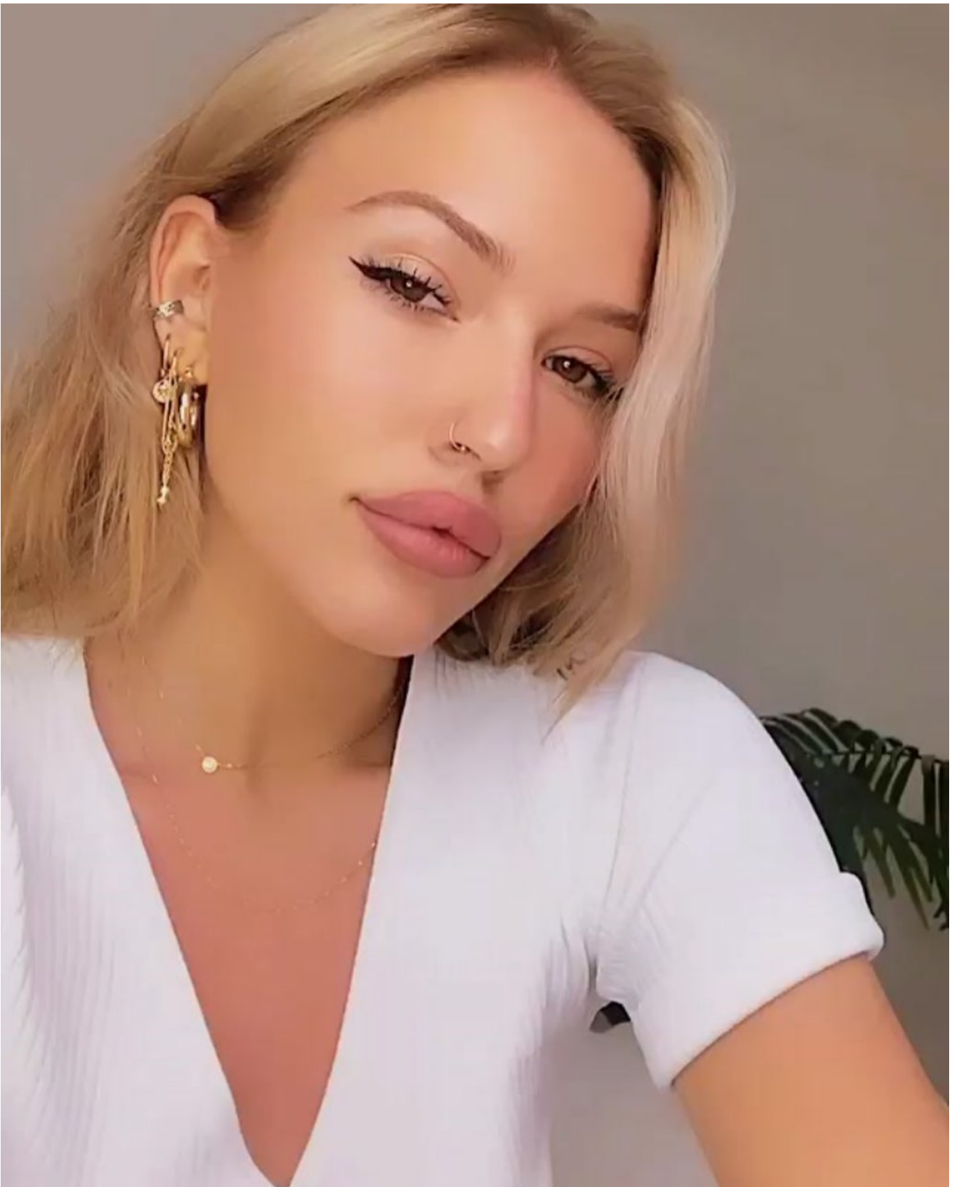
I am so incredibly grateful for you guys. Having this kind of support means more than you could ever know.