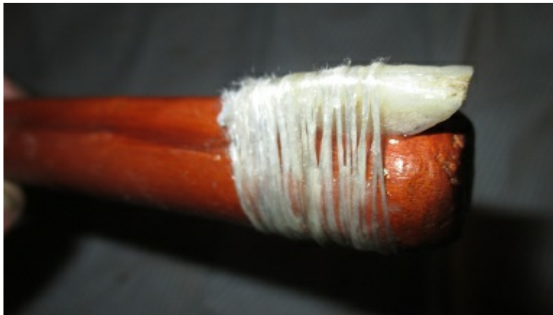
The atlatl after I repaired it with bone from the T-bone steak.

The wooden spur on my atlatl broke off and I planned to replace it with a spur carved from bone because traditional ones were often made with bone spurs. That's why I bought the T-bone steak. I bought the steak on the same day Roger Stone's car got T-boned in an assassination attempt, and this was a sign from the heavens telling me the cult was responsible.