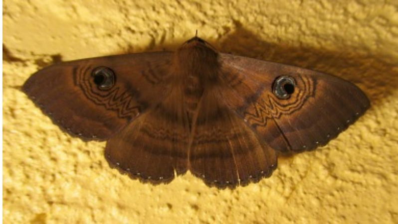
Close-up of the moth, "eye" patterns clearly visible.

I watched the biology video in 2015, at a time when I still wanted to go to university. When I watched the biology video about the moth in 2015 I was still an atheist (science believer) but even then the explanation of natural selection and random mutation seemed very inadequate to me because it ignored the glaring fact that there is a natural order to the universe, an intelligence. It's not undirected chaos.