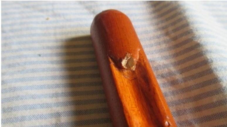
The broken spur.