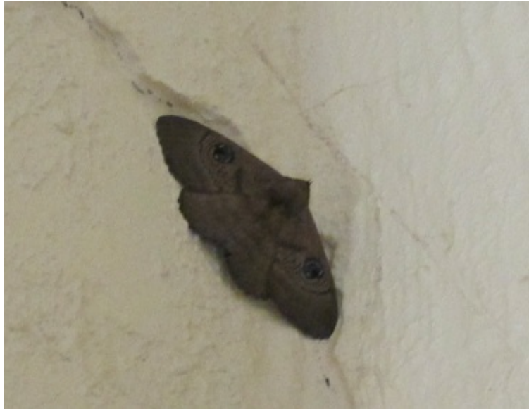
First appearance of the sign of the moth.