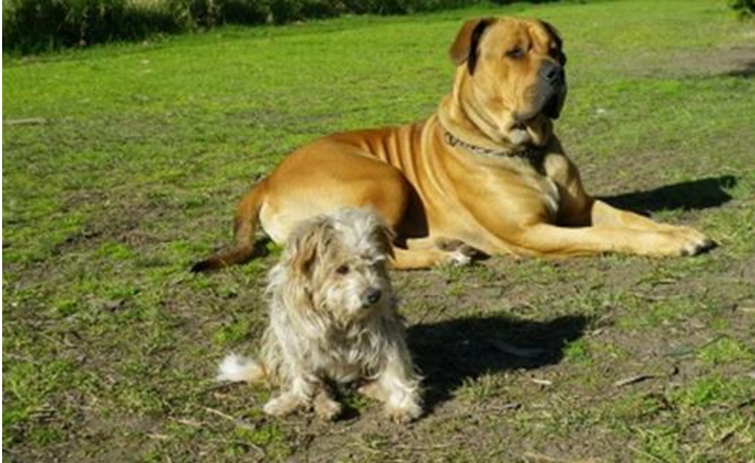
Millie (front) and Big Dog (rear).