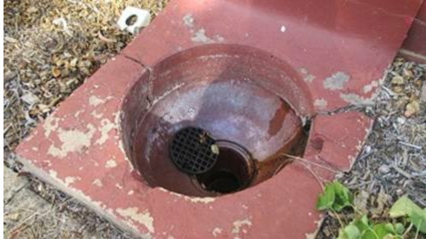
The drain Blossom got stuck in.

She must have stumbled into the drain because after all she's mostly blind and can't walk right (my dog Millie had the identical condition). Also, the mesh/strainer of the drain flips open easily when pressure is applied.