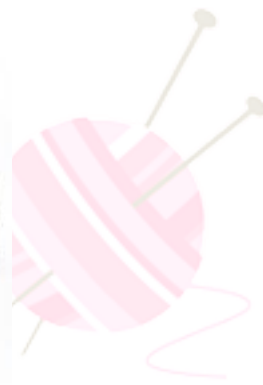
Nakolen Dreams 31446 (4 Balls)