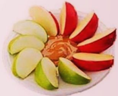
APPLES + PEANUT BUTTER