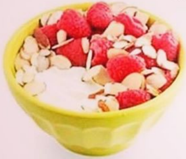
GREEK YOGHURT + FRUITS + ALMONDS