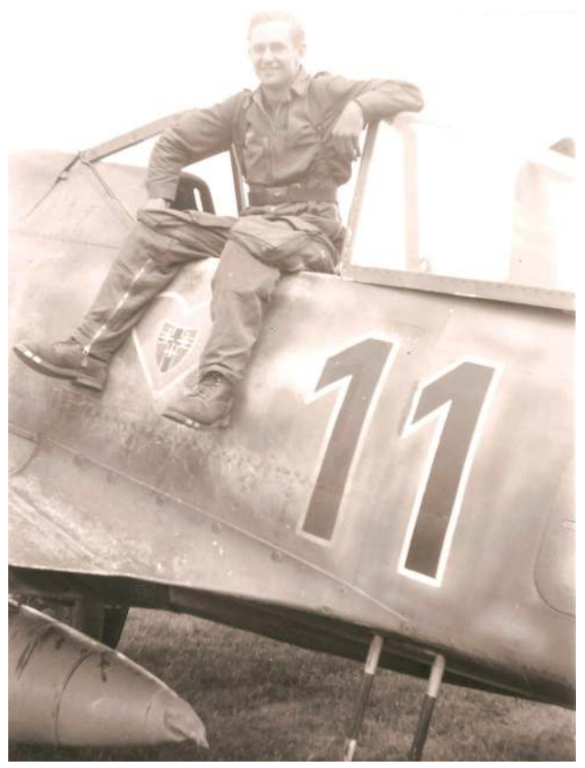
■ An unidentified pilot of 8./JG54 with his Focke Wulf 190, May 1944.