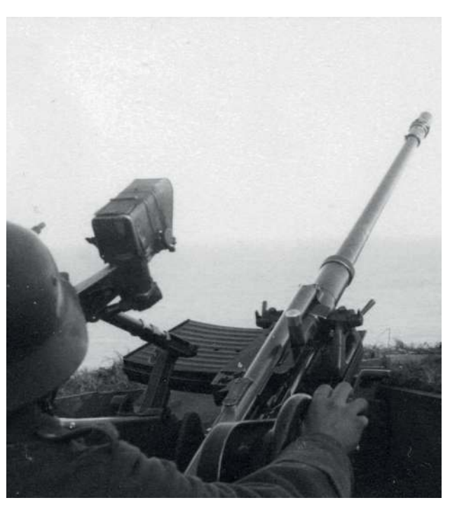
■ Light German flak in Normandy during the summer of 1944. Flak was deadly to friend and foe alike and there were frequent 'friendly fire' episodes.