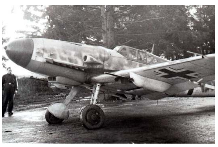
■ Messerschmitt Bf 109 G-6 of 5./JG2 flown by Oblt. Gerd Schaedle photographed at Creil just before the invasion.

66Our losses during these attacks were enormous. I had seen how my comrades were butchered. These combats were so cruel, and the enemy's air superiority was overwhelming. ?? Unteroffizier Aegidius Berzborn