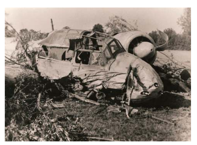
An unidentified Junkers 88 R-2 of I./ZG1. shot down over Normandy, June 1944.

"...the pilot obtained a visual on an aircraft at 1,000 feet silhouetted against cloud [which] helped him to recognise it as an Me 410. The aircraft was carrying no lights. Fg Off Lelong then flew in a steady climb to just underneath the enemy aircraft and confirmed it as an Me 410, he then throttled back and pulled up to dead astern and at a range of 150 yds, opened fire. Strikes were seen around the cockpit area and the aircraft then burst into flames. It then lost height slowly in a spiral dive and finally crashed about seven miles SE of Evreux airfield. Fg Off Lelong then lost height and took photographs of the aircraft burning on the ground. Five minutes later the aircraft exploded and pieces continued to burn..."