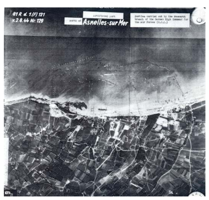
German reconnaissance photograph taken from high altitude of Asnelles-sur-Mer, Normandy, but showing the Mulberry Harbour at Arromanches. The photographing unit is stated as being 1.(F)/121 which was operating Me 410s, but in fact was taken by Oblt Erich Sommer who was flying an Arado 234 jet.