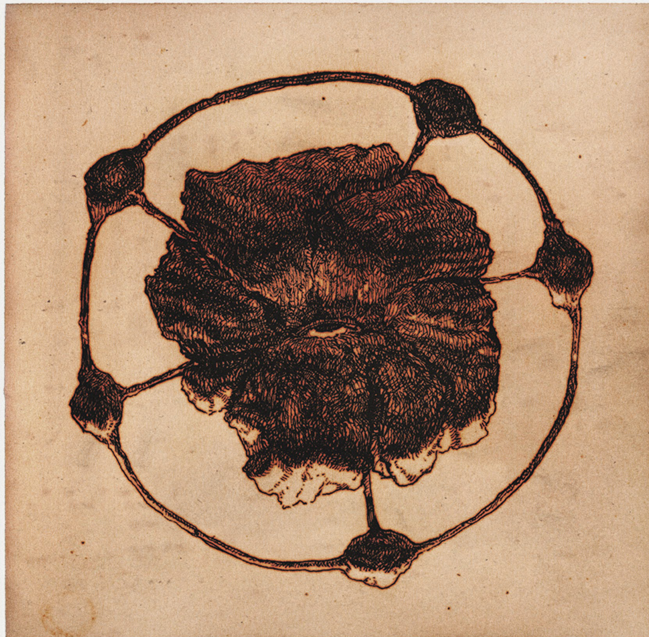
Found 1995, Marros Pendine