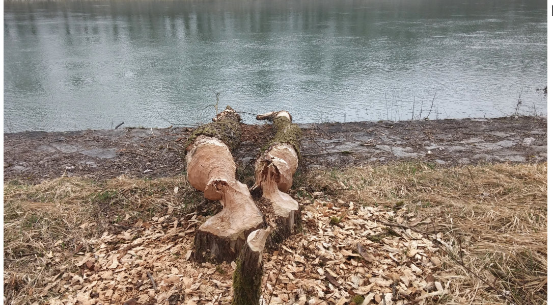
Things To Know Before You Get This

A lot of the time, your house's sump pump, comprehending its operations, and above all, recognizing just how to preserve it, are all essential to keeping your house in leading shape. A sump pump is a little, electrically ran water pump located in a lined hole called a sump pit. The pump is created to be immersed in water.