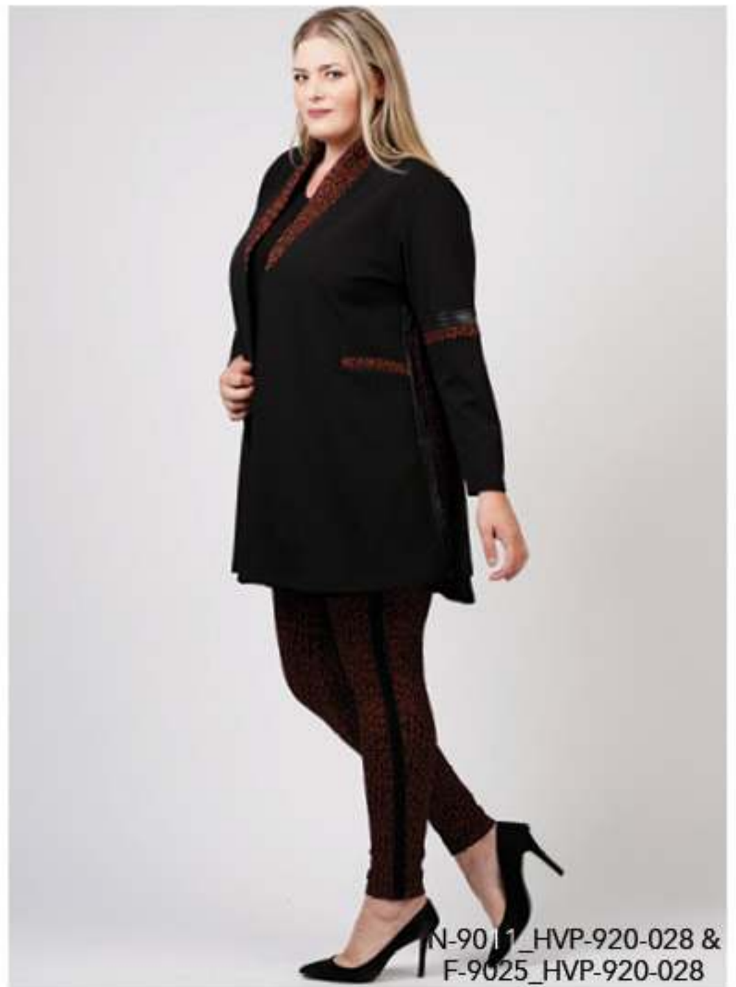
N-9011_HVP-920-028 & F-9025_HVP-920-028