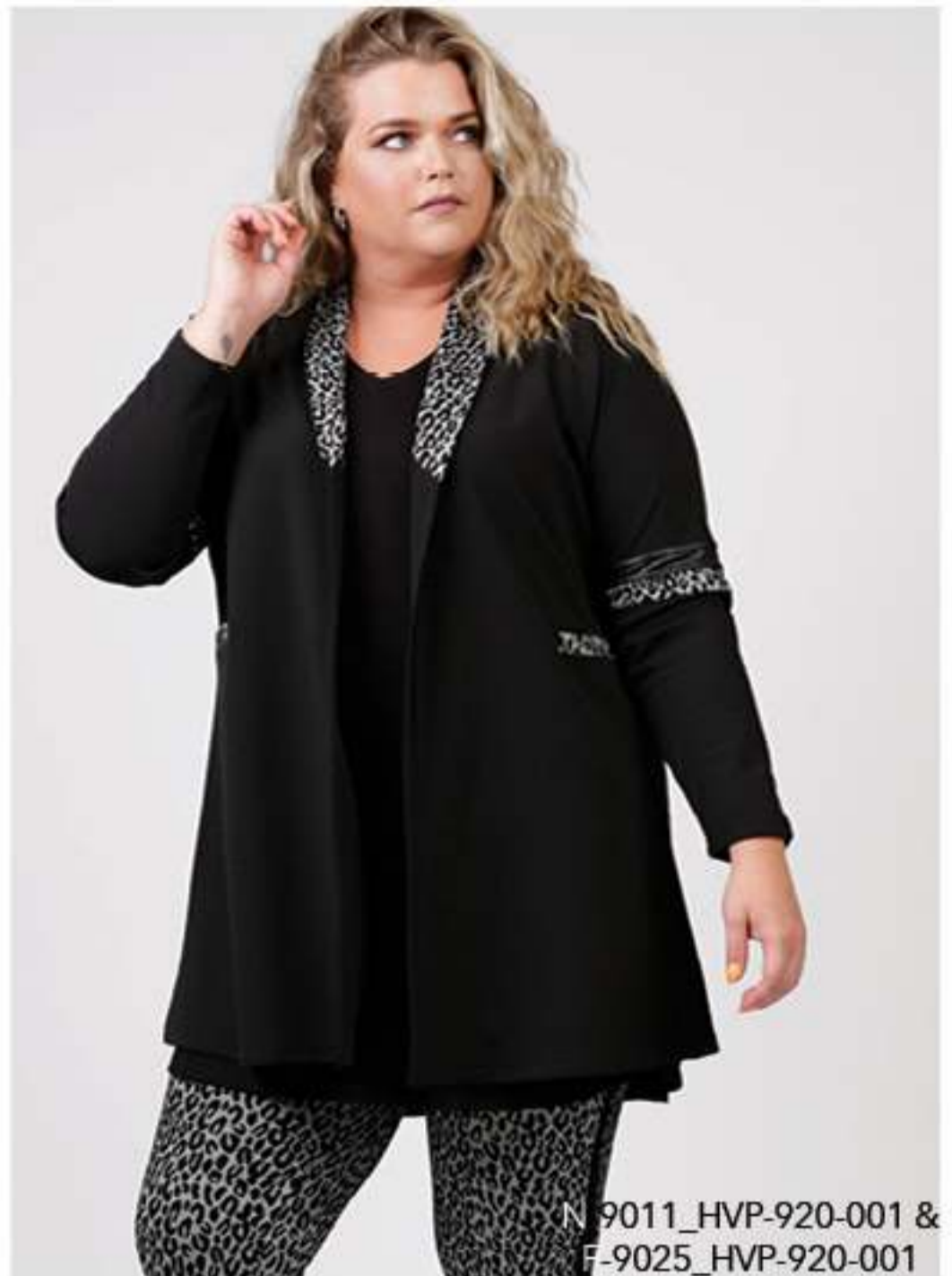
N-9011_HVP-920-001 & F-9025_HVP-920-001