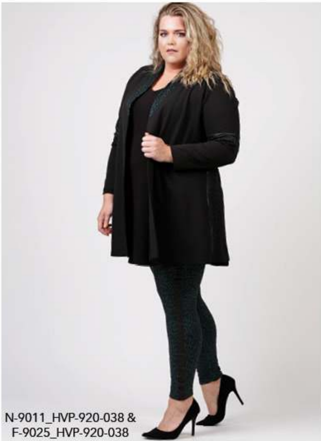
N-9011_HVP-920-038 & F-9025_HVP-920-038