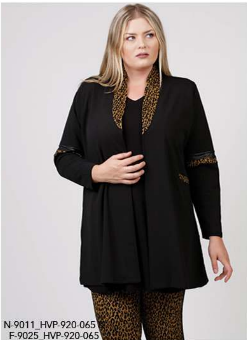
N-9011_HVP-920-065 & F-9025_HVP-920-065