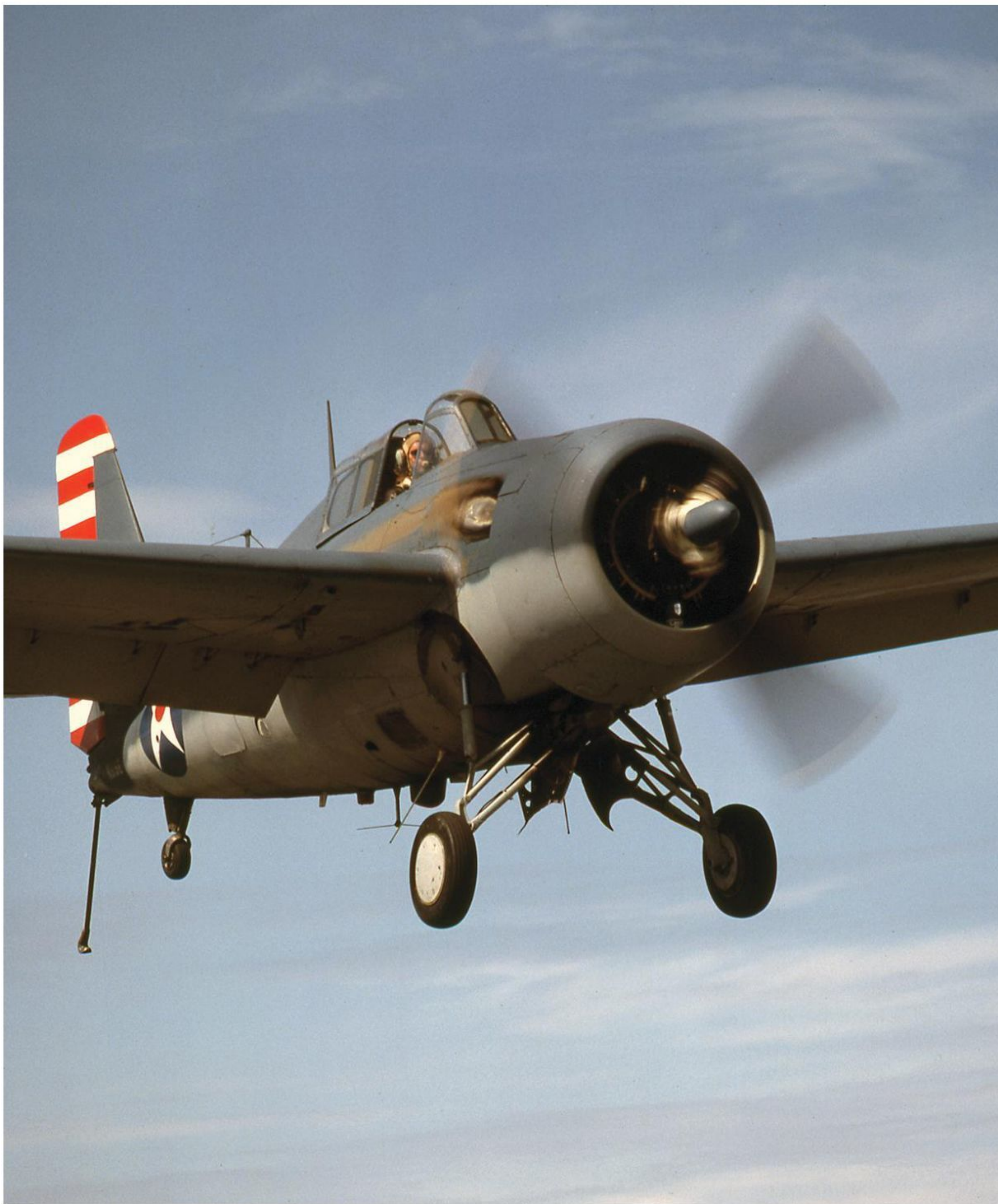
Down and dirty, and in the groove! Getting the gear up and down in a Wildcat is a very physical maneuver.

left flap at 150mph and the right at 125mph. Be prepared to counter this with the ailerons, mixture auto rich, boost pump on, tailwheel locked. Change hands, gear selector down, unload the crank handle and crank the gear to the down position, check canopy open and locked. Trim the aircraft for 120mph. Opposite the point of landing, check power and trim for 100mph. Initiate your turn to