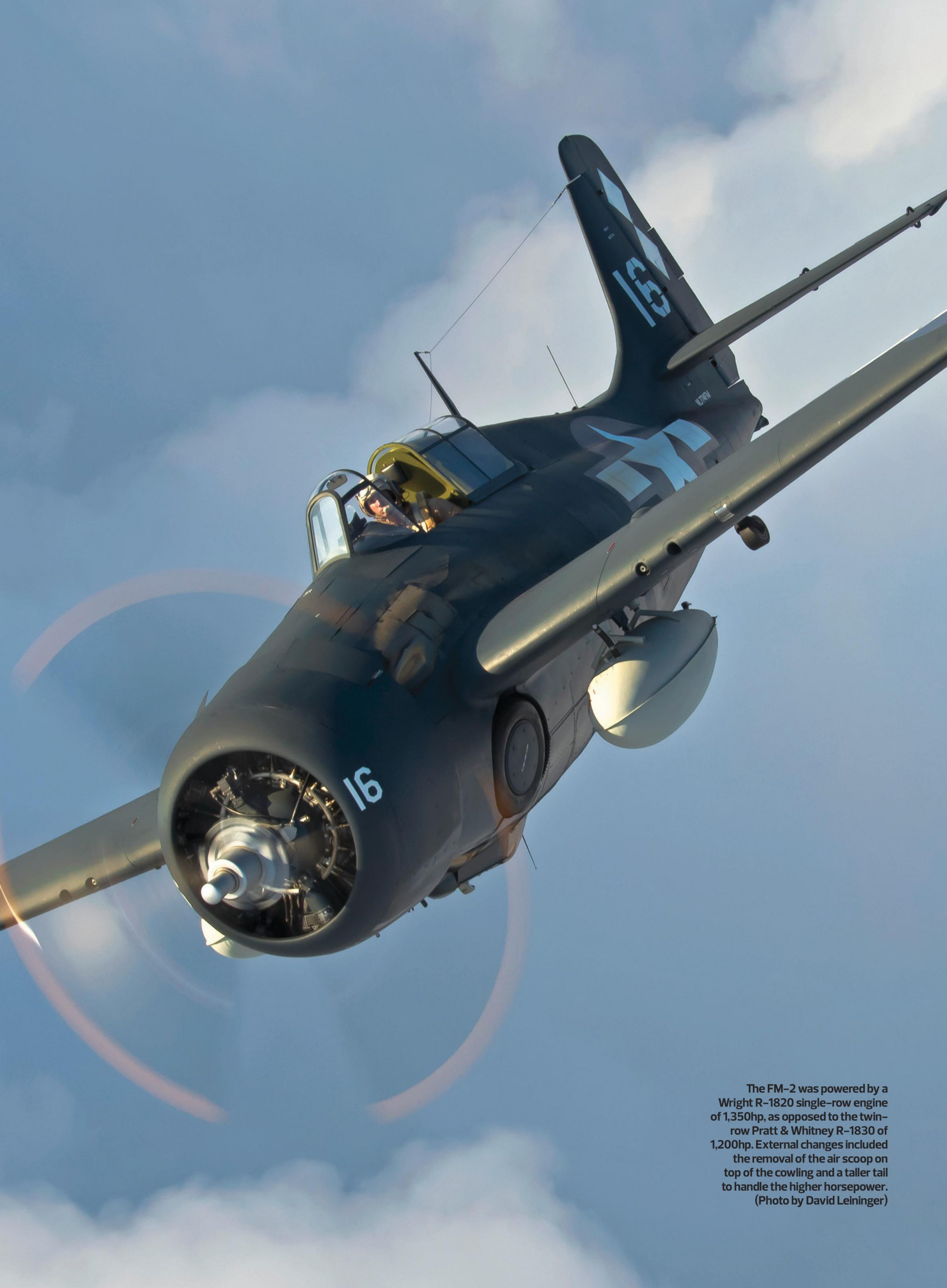
The FM-2 was powered by a Wright R-1820 single-row engine of 1,350hp, as opposed to the twin-row Pratt & Whitney R-1830 of 1,200hp. External changes included the removal of the air scoop on top of the cowling and a taller tail to handle the higher horsepower.