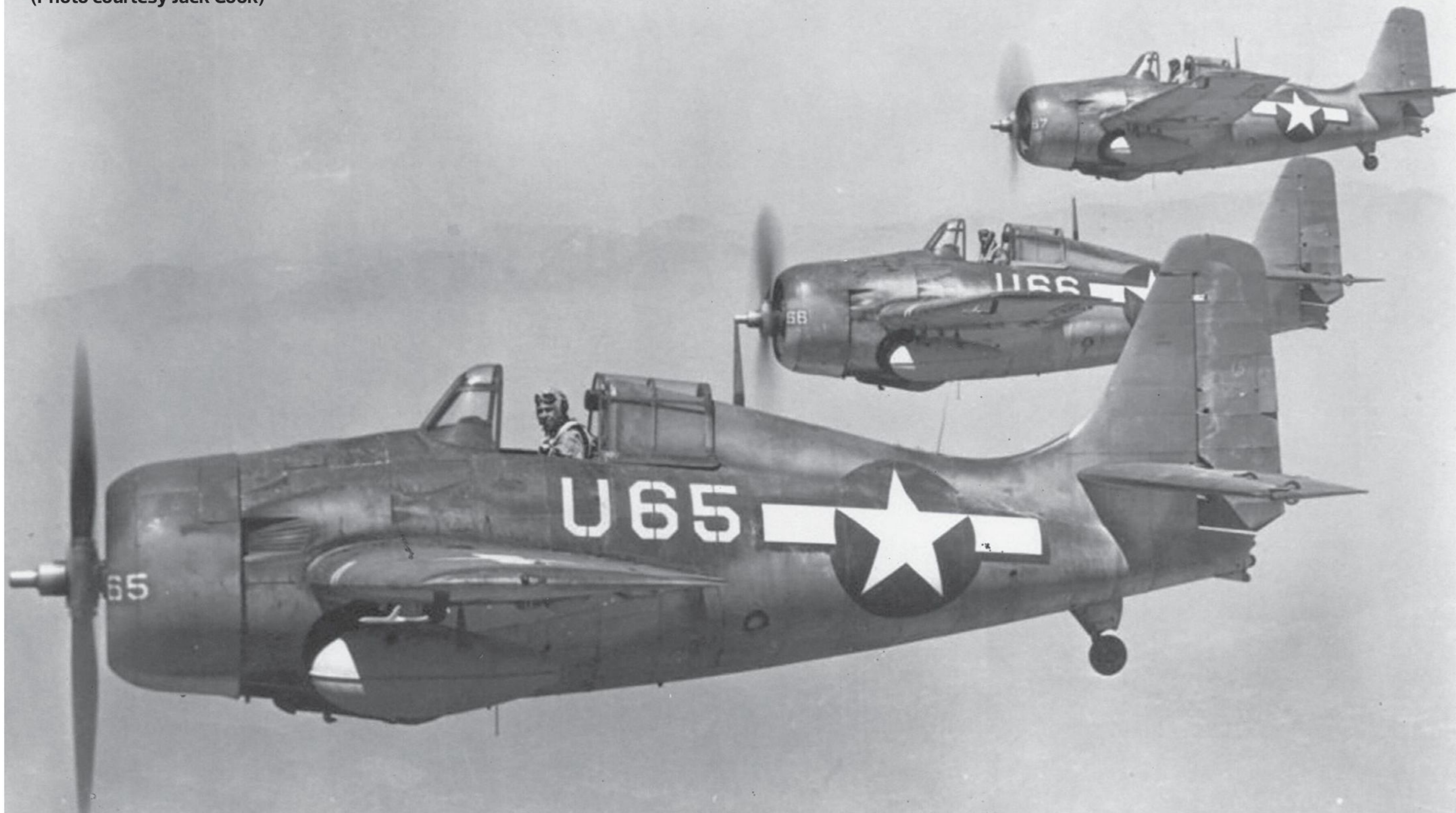
The Wildcat bore the brunt of early combat in the Pacific Theater, and pilots developed tactics, such as the "Thatch Weave," to counter the threat presented by the Zero.

Cleared for takeoff, stick full aft, power is brought up smoothly and continuously to 46.5 inches/2,500rpm. The aircraft accelerates briskly, and aft stick pressure will build rapidly to the point where it must be released to allow the tailwheel to fly off, approximately 8 to 12 inches. The aircraft