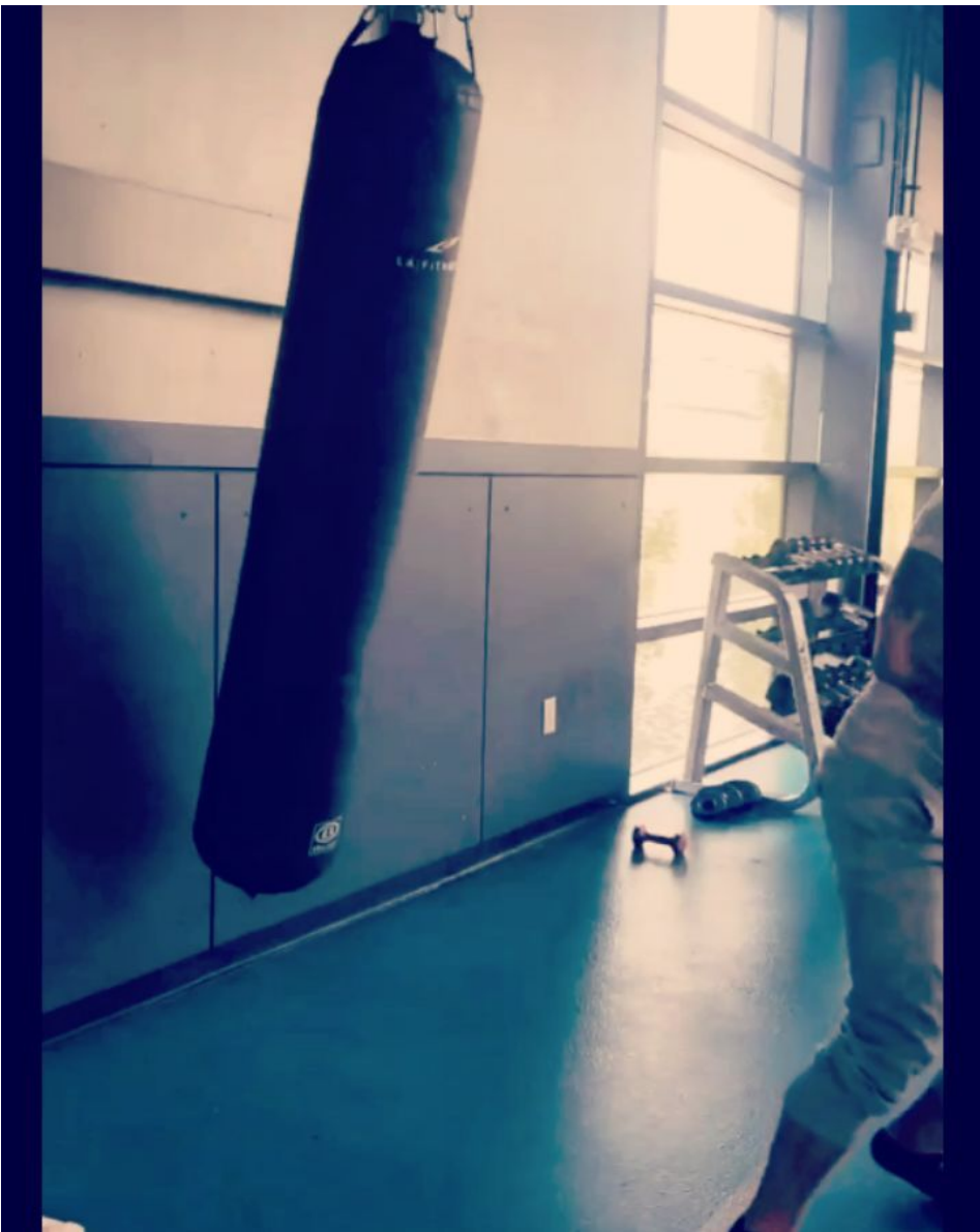
#gymcouple #couplegoals #fitness #squats #deadlift #gymgoals #workout #muscle #stretch #passion #gym #gymoutfits #personaltrainer #training #lifegoals #healthylifestyle #fabletics