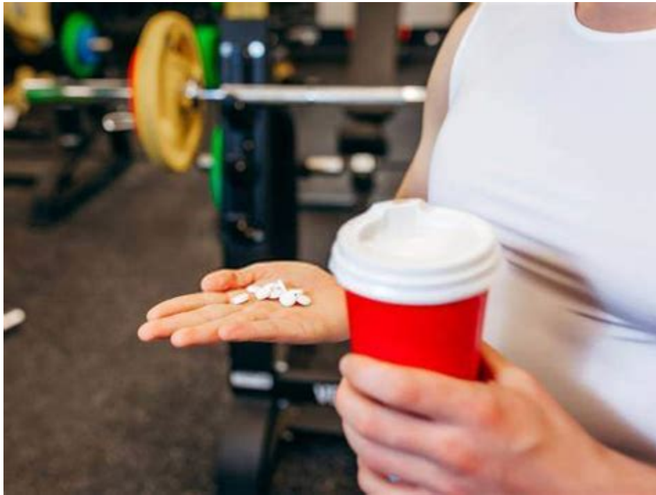
Table Of Contents So, why Dianabol in stacks? Dianabol steroid is a kick-starter, a fast-acting muscle builder that it kicks in very quickly and brings dramatic gains along with it. This is why it is a cornerstone in bulking stacks; it brings up the gains during the bulking cycle because of the metabolic push it gives to your body.