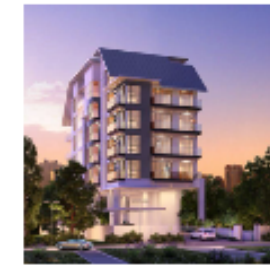
Lorong G, G Residence

No. 25 Jalan TPP 5/13 Taman Perindustrian Puchong Seksyen 5, Batu 12, Jalan Puchong 47100 Selangor, Malaysia