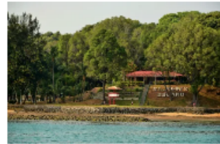
St. John's Island

BNF Engineering is a multi disciplinary company that engages in M&E and A&A filling works to help our clients optimise the potential of their existing facility.