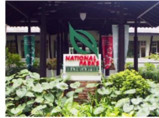
National Parks Board (NParks) HQ

Nestled in the Ginger garden within Singapore Botanical Gardens, serving impeccable food. BNF was appointed to improve the space by building the