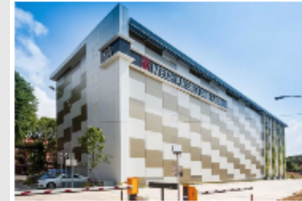
Changi Village Mechanised Carpark

BNF was tasked with building the first HDB Mechanised Parking System (MPS) in Singapore where we also developed the software and application of the parking system. The project helped to solve a parking constraint issue in the area, increasing the number of spaces by two fold.