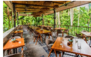
The Halia @ Singapore Botanical Garden