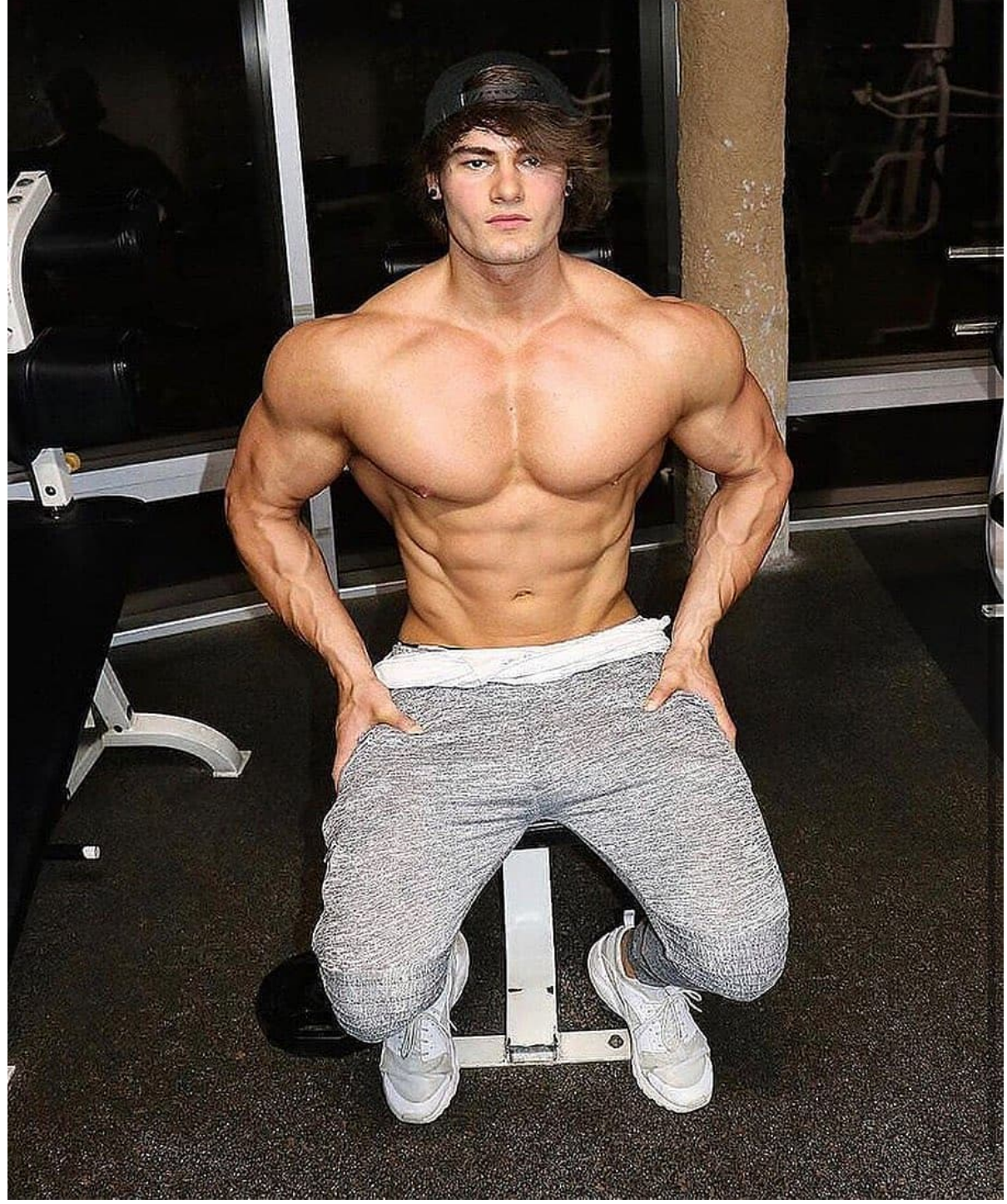
It's been interesting! I've been forced to #thinkoutsidethebox and try to find new and inventive ways to complete the movements; incorporating varying reps and set patterns, loads and other exercises to mix it up.