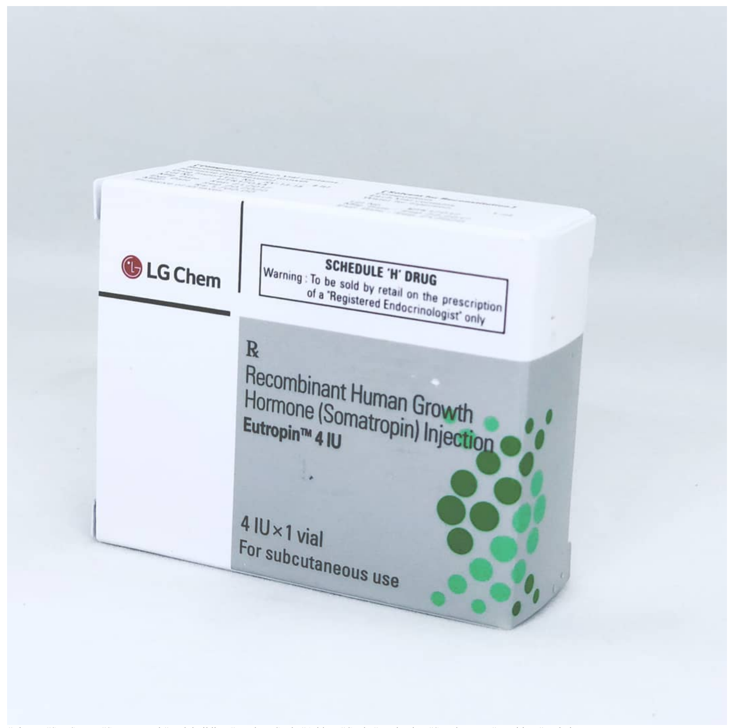
\#Fitness\ \#StayStrong\ \#StayFocused\ \#Bodybuilding\ \#WorkoutGoals\ \#Athlete\ \#Goals\ \#Motivation\ \#Supplements\ \#Nutrition\ \#Vadodara\ \\ \underline{https://www.docdroid.net/wJkxdxb/donde-comprar-anapolon-pdf}