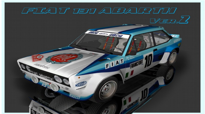
Fiat 131 Gr.2

In this issue : Results of Rally Sweden and Routes du Nord, Test of VW Polo R5 and Skoda Fabia R5 Evo and the presentation of CFR Pro Team Good reading !