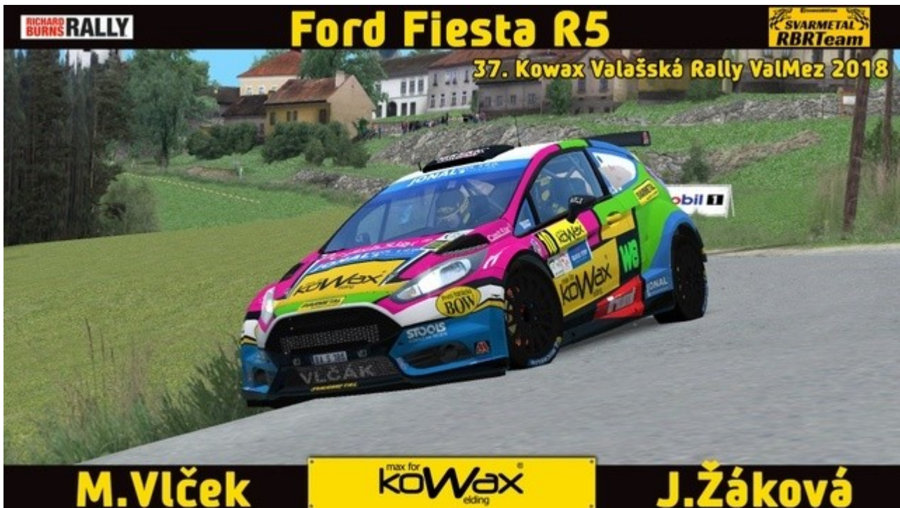
Ford Fiesta R5 Vlček / Žáková Valašská Rally ValMez 2018 (by Maxrally)

https://uloz.to/file/6NYe8XSSLP13/fiestar5-vlcek-2018-vr-rar