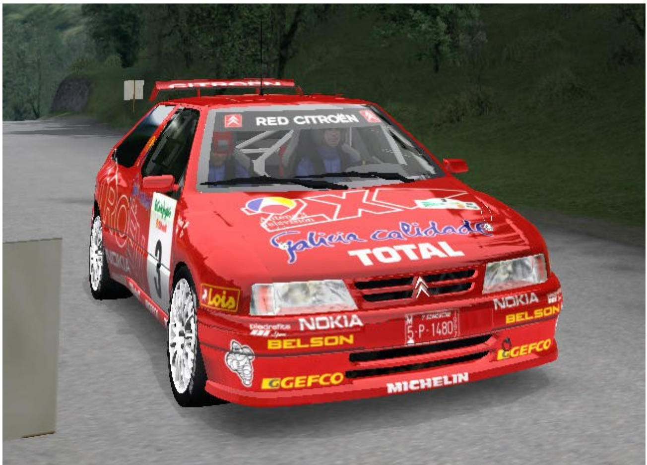
Citroen ZX Kit Car Puras / del Barrio Rallye El Corte Ingles 1997 (by PetrovPG)

https://uloz.to/file/6NYe8XSSLP13/fiestar5-vlcek-2018-vr-rar