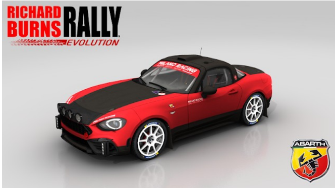
Fiat 124 RGT

Hello and welcome, on the last issue you was numerous to notice than the mistake in the comparative test, it was in fact the Fiat 124 Abarth RGT, the Fiat 131 is now an historic car and compete in FIA Gr.2, sorry for that, but thanks a lot it's prove to me that you're really reading this magazine !