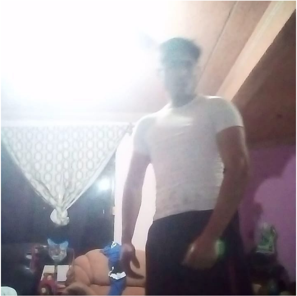
It works coz the LEYDIG cells in the testicles convert cholesterol in testosterone and eating more coconut oil and olive oil helps LEYDIG cells absorb more

https://www.docdroid.net/M0JiRur/turinabol-10-mg-achat-canada-pdf