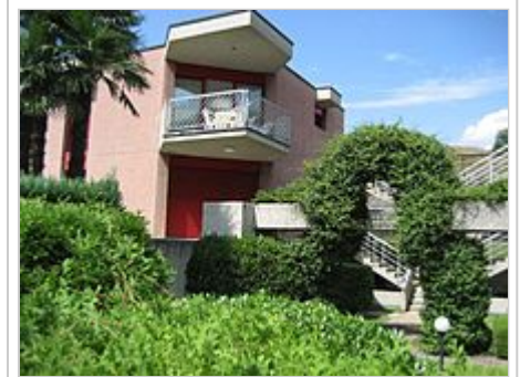
Franklin University Switzerland, Residenza Panera