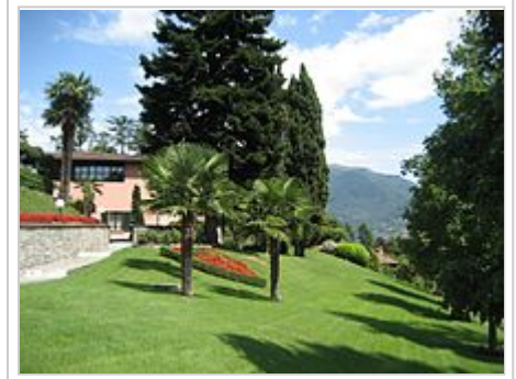
Franklin University Switzerland, the main campus