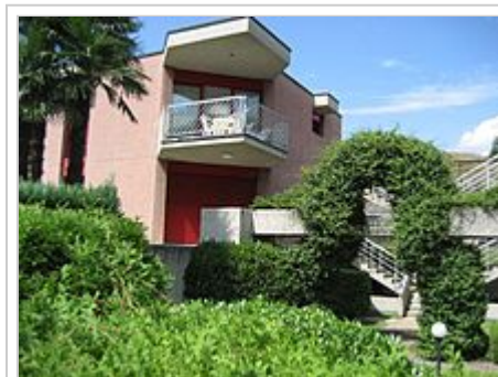
Franklin University Switzerland, Residenza Panera