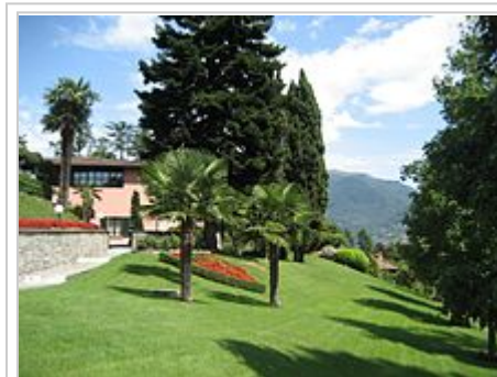
Franklin University Switzerland, the main campus