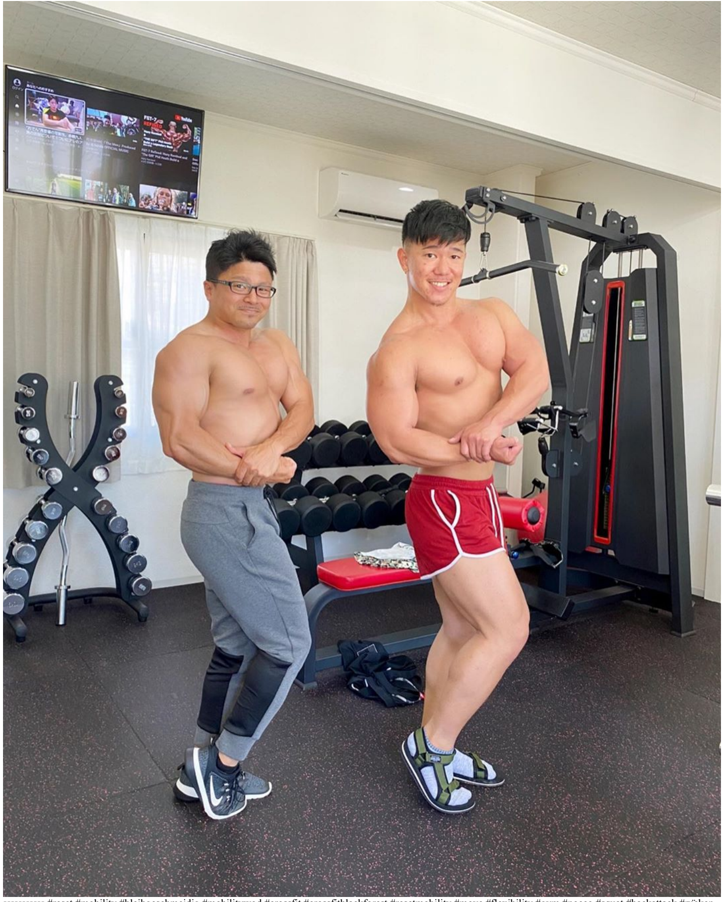
#reset #mobility #bleibgeschmeidig #mobilitywod #crossfit #crossfitblackforest #resetmobility #move #flexibility #gym #nocco #squat #backattack #rucken #trapez #back #rhomboiden #rotatorenmanschette #rucken