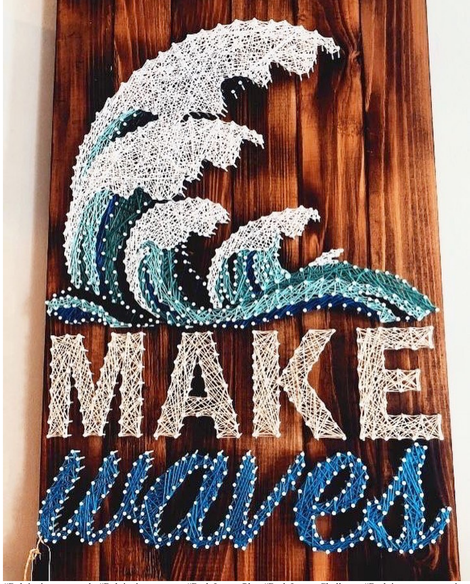
#Belgianimpactcouple #Belgianimpactteam #BodyImpactPlan #BodyImpactChallenge #Bodyimpactquarantainechallenge #Health #Healthy #Fitness #Nutrition #Fit #Results #Herbalife #Food #Healthyfood #Family #Smoothie #Fitlife #HealthyLife #GetHealthy #Weightloss #Looseweight #Energy #FitFood #EatClean #GetFit #Quote #Quotes #QOTD #QuoteOfTheDay 1080