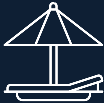
Crystal Lagoon & Beachfront