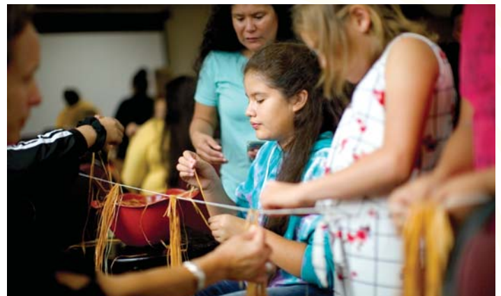
Photos (clockwise from top left): La Familia Counseling Center, On the Move LGBTQ+ Connection, Two Feathers Native American Family Services, and the Hmong Cultural Center of Butte County

African Americans; Asians and Pacific Islanders (API); Latinx; Lesbian, Gay, Bisexual, Transgender, Queer, and Questioning (LGBTQ+) communities; and Native Americans are now a plurality in California. Reflecting honestly, it was clear our public health system repeatedly failed these communities. In many cases, the system was contributing to ongoing and historic trauma by reinforcing and enforcing racist and discriminatory policies, procedures and practices. The Mental Health Services Act opened the door for a new generation of practices and policies to begin transforming our assumptions and approach. After many years of funding traditional clinical approaches, this movement produced the California Reducing Disparities Project (CRDP) within the Office of Health Equity, at the California Department of Public Health. The CRDP establishes a platform for community defined evidence-based practices (CDEP) to orient and ground the next generation of care.