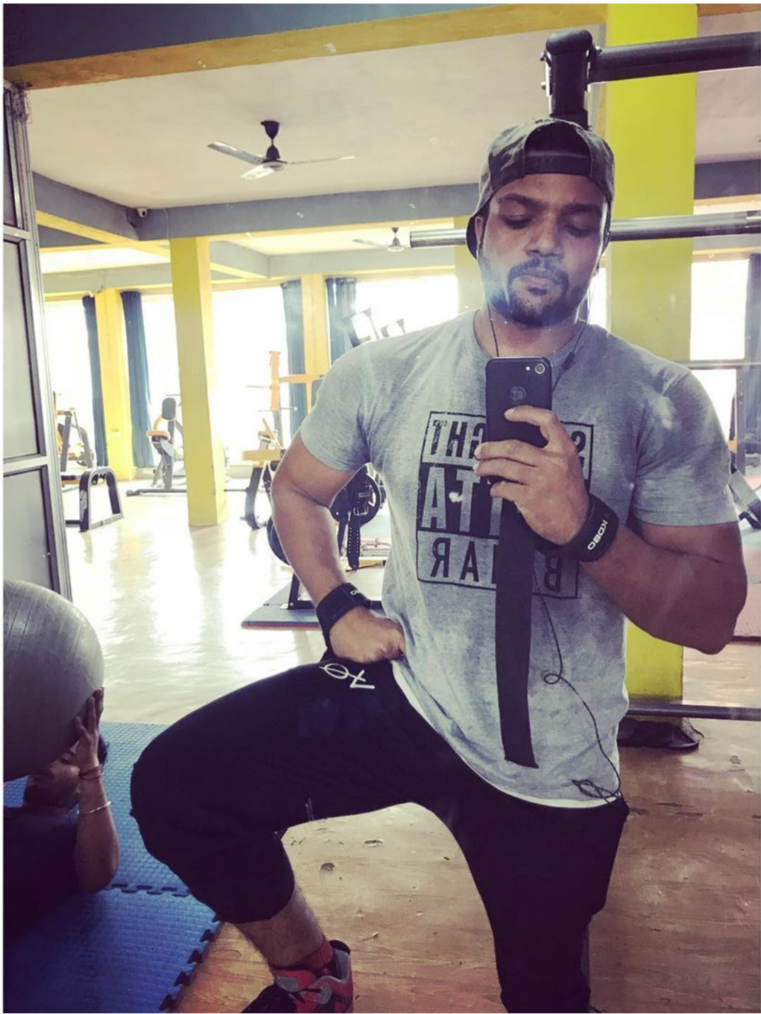
@uneformandoatletas @sunwarriorperu @esportiva.pe @rexona_peru @poweradepe @ceraveperu @larocheposaype