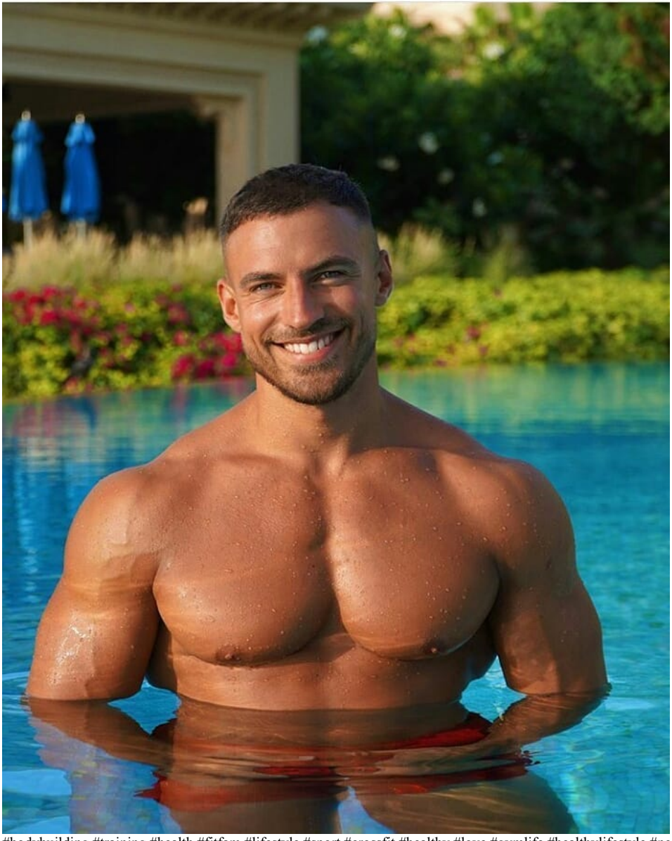
#bodybuilding #training #health #fitfam #lifestyle #sport #crossfit #healthy #love #gymlife #healthylifestyle #personaltrainer #instagood #muscle #exercise #weightloss #gymmotivation #fitnessmodel #fitspo #fitnessgirl #instafit #yoga #wellness#bhfyp 917