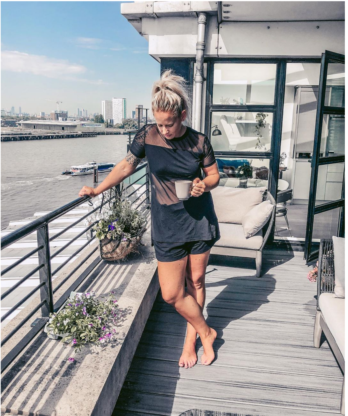
Morning all ☺ Another day another coffee ☺ I will be posting a brilliant scuttling & toning upper-body later so keep a look out ☐ 1350