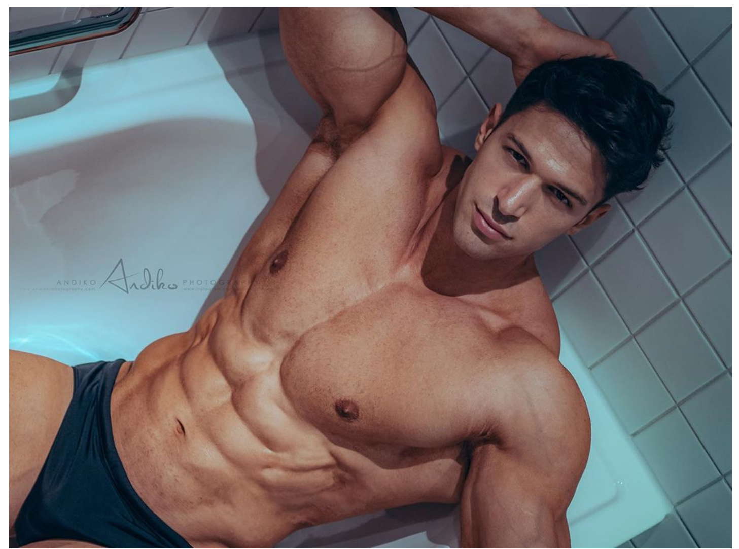
About Testosterone / Trenbolone / Masteron Mix. Those who have heard of a Testosterone, Trenbolone and Masteron cycle will know that it is usually reserved for more advanced users who have a history of taking these types of products in order to boost the aesthetic or fitness elements.. This particular item is a formula that contains multiple chemicals within the one ampoule, and the mix holds: