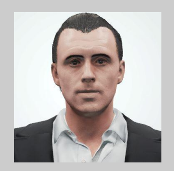
Welcome to Vibert's VLOG