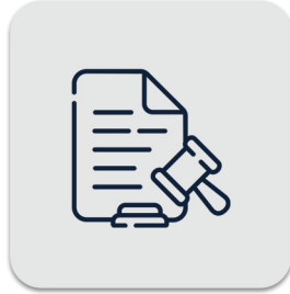
Legal Representative Services