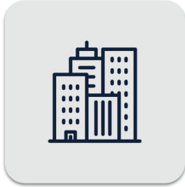
Company Formation & Licensing