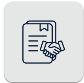
Investor Rights & Protection