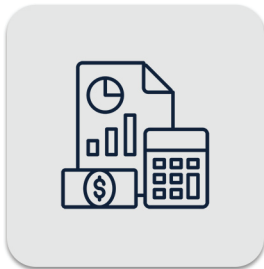
VAT & Tax Consulting