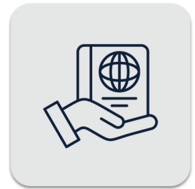
Golden Visa Services