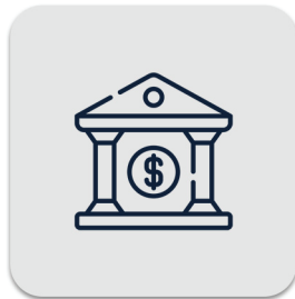
Bank Account Assistance