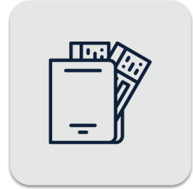
Visa & PRO Services