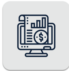
Accounting & Auditing