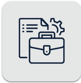
Business Centers and Office Space