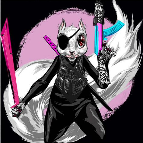
THE REAPERS Breed: White Albino Total Supply: 250 % of Drop: 2.5%

Made up of members from 10 different gangs, these 12 breeds of squirrels are brutally violent and will stop at nothing to abolish their enemiez.