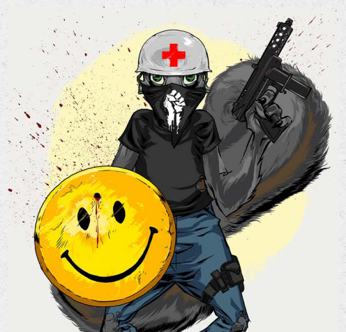
SQUIRRELS FOR LIBERTY Breed: Eastern Grey Squirrel Total Supply: 1200 % of Drop: 12%