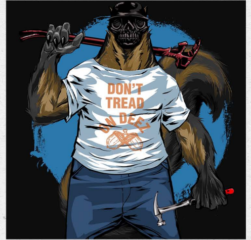
NUTCRACKERS MC - ENFORCERS Breed: Grizzled Giant Squirrel Total Supply: 1000 % of Drop: 10%