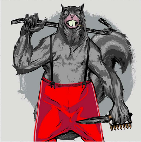
OAK STREET BOYS - BRAWLER CLASS Breed: Grizzled Giant Squirrel Total Supply: 1000 % of Drop: 10%