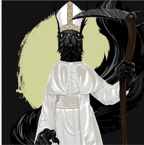
PADRE Breed: Calabrian Black Squirrel Total Supply: 400 % of Drop: 4%