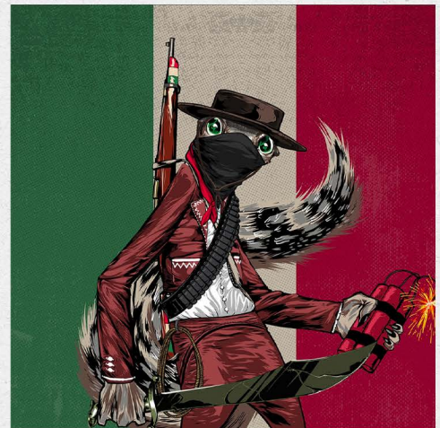
BANDA de LADRONES Breed: Mexican Ground Squirrel Total Supply: 900 % of Drop: 9%