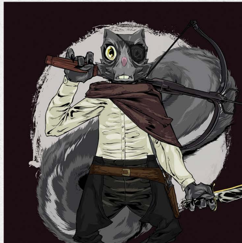
THE DUSTY NUT OUTLAWS Breed: Western Grey Squirrel Total Supply: 1200 % of Drop: 12%