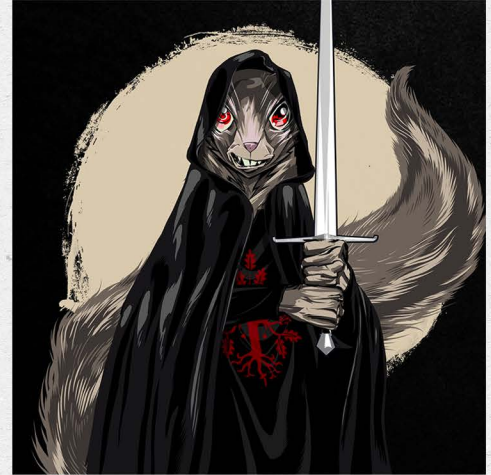
THE FIRST ORDER Breed: Fox Squirrel Total Supply: 500 % of Drop: 5%