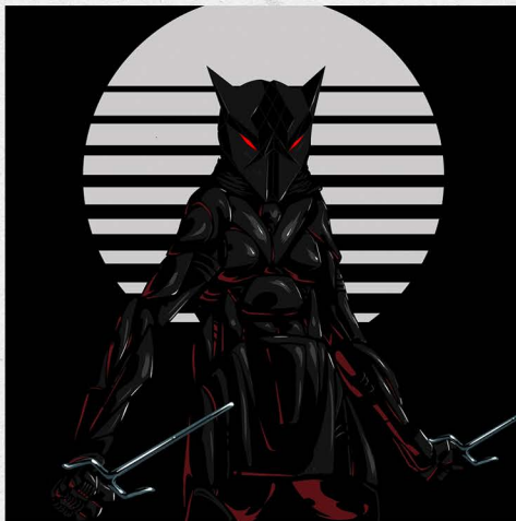
SHADOW SECT Breed: Finlayson's Squirrel Total Supply: 800 % of Drop: 8%