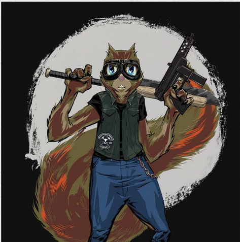
NUTCRACKERS MC - MEMBERS Breed: Plantain Squirrel Total Supply: 1000 % of Drop: 10%