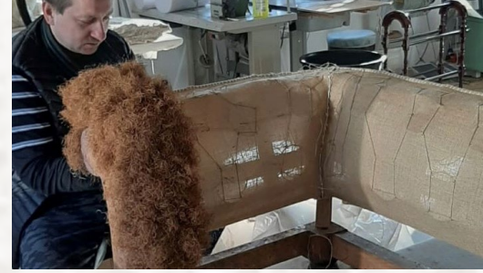
Bridle loops and first stuffing.