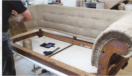
Edge stitching and second stuffing ties.