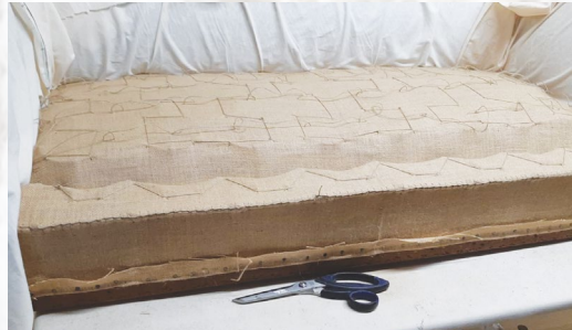
Seat bridle ties and more stuffing.