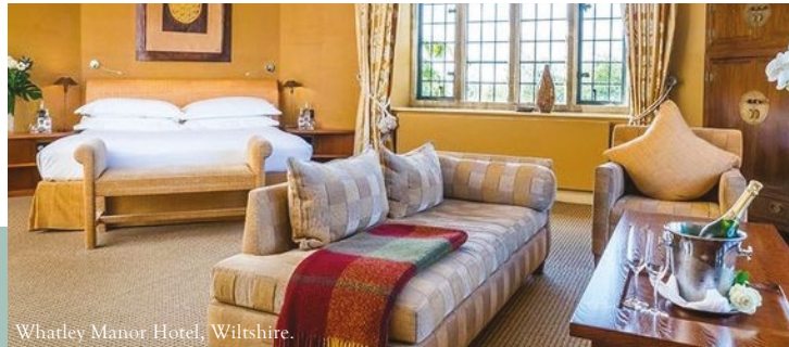
Whatley Manor Hotel, Wiltshire.