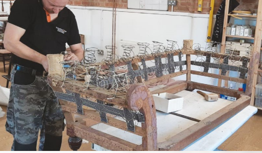
Frame examination and repair, hand tied springs.