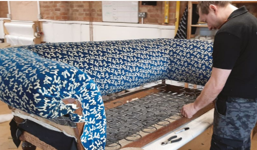
Seat hand tied springs.