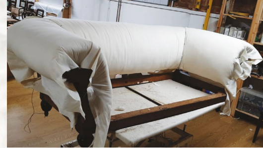
Calico cover before top fabric.