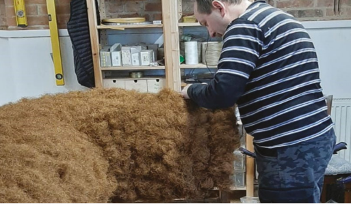
Fibre stuffing continued.