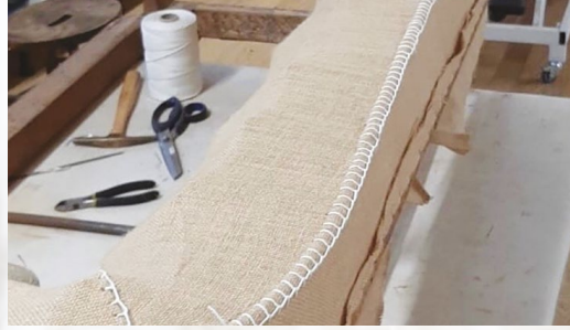
Cane edge and blanket stitching.