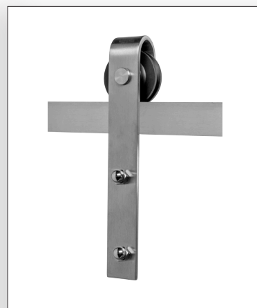
Brushed Stainless Steel

*Quick Ship: We make every effort to ensure all Quick Ship Items are in stock. However, we do not guarantee stock. Please call your representative for availability.