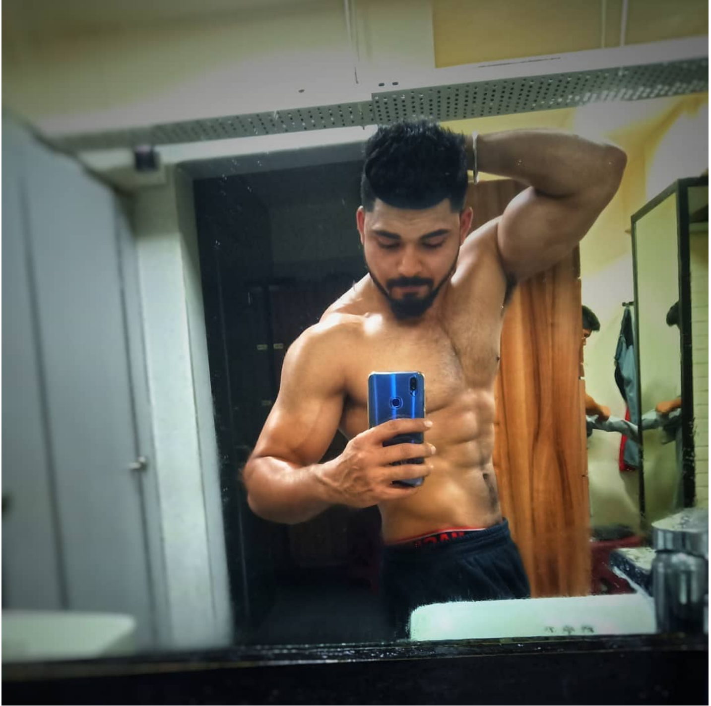
And even before lockdown happened, I'd gotten into some unhelpful eating habits. I do struggle when I'm in of season.

You'll find that there are two different esters of this compound. RAD-140 and RAD-Beta. RAD-140 is the more widely used variety. It is used in cutting cycles by bodybuilder, and can help remove that last little bit of stubborn body fat that often hangs on for dear life in the gym. It can also boost the levels of body fat, which can otherwise dwindle away before their very eyes. If you're looking for a compound that can help improve athletic performance without increasing your mineral status, you'll find that Masteron is a very powerful one. It is difficult to say exactly how anyone will respond to a supplement like Masteron. However, due to its nature as an anti-estrogen, the side effects are much less serious and significant than you might experience with something like Trenbolone. Masteron is also less likely to cause things like roid gut. There are two types of this drug: propionate and enanthate. Ethanate originated in underground labs and saw most of its use in the early 2000s. At the time, there was a high demand for the steroid because its propionate counterpart needed to be constantly injected into the