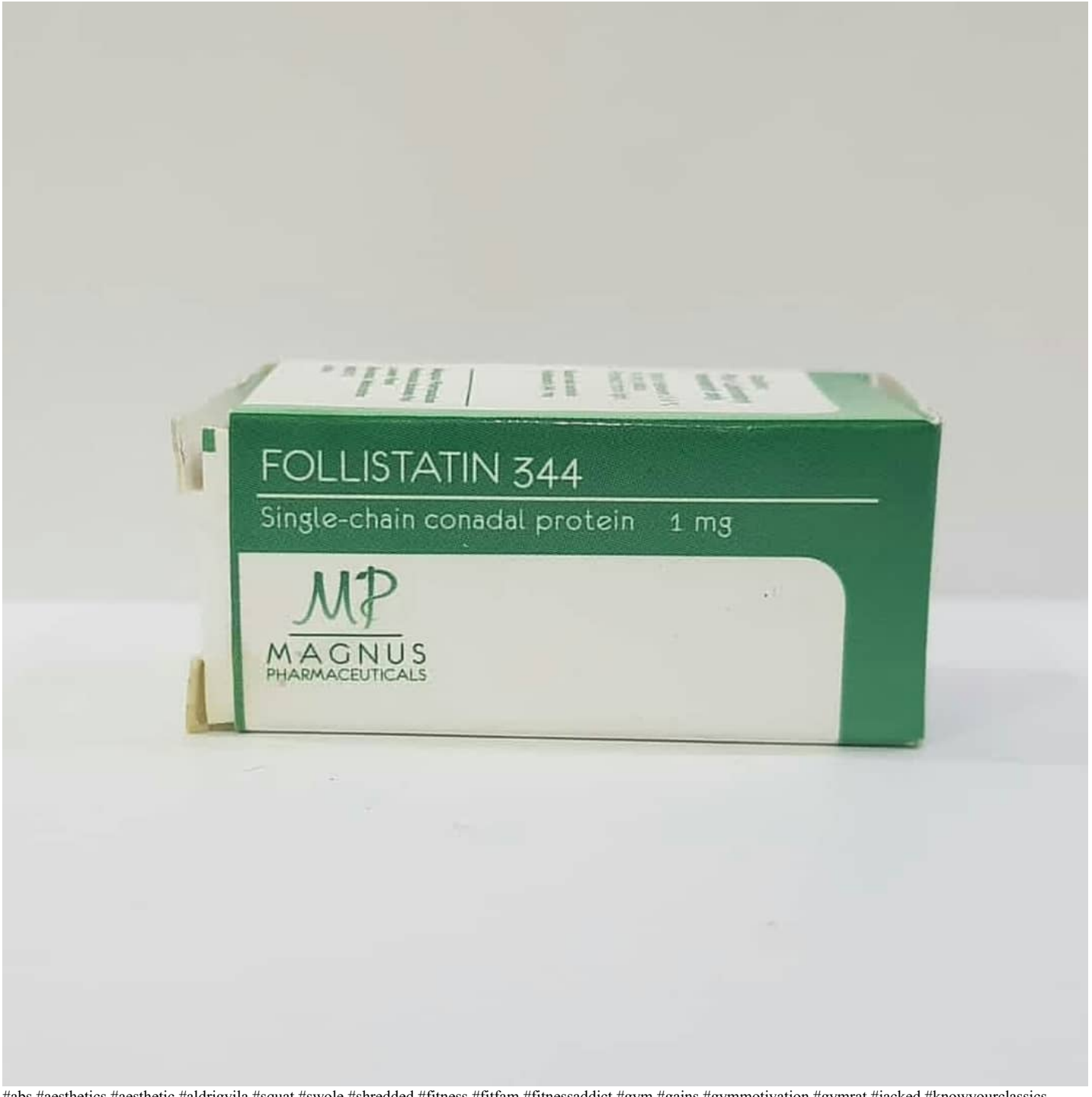
#abs #aesthetics #aesthetic #aldrigvila #squat #swole #shredded #fitness #fitfam #fitnessaddict #gym #gains #gymmotivation #gymrat #jacked #knowyourclassics #legday #zyzz #chestday #bodybuilding #bodybuilder #beastmode #beast #biceps #muscle #motivation #oldschoolbodybuilding #physique 720