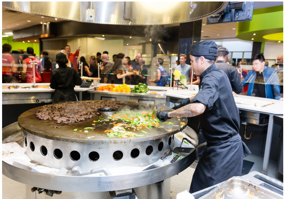
Residence meals are served in our large, newly renovated dining hall in Residence Commons which offers a wide selection of healthy and nutritious foods.