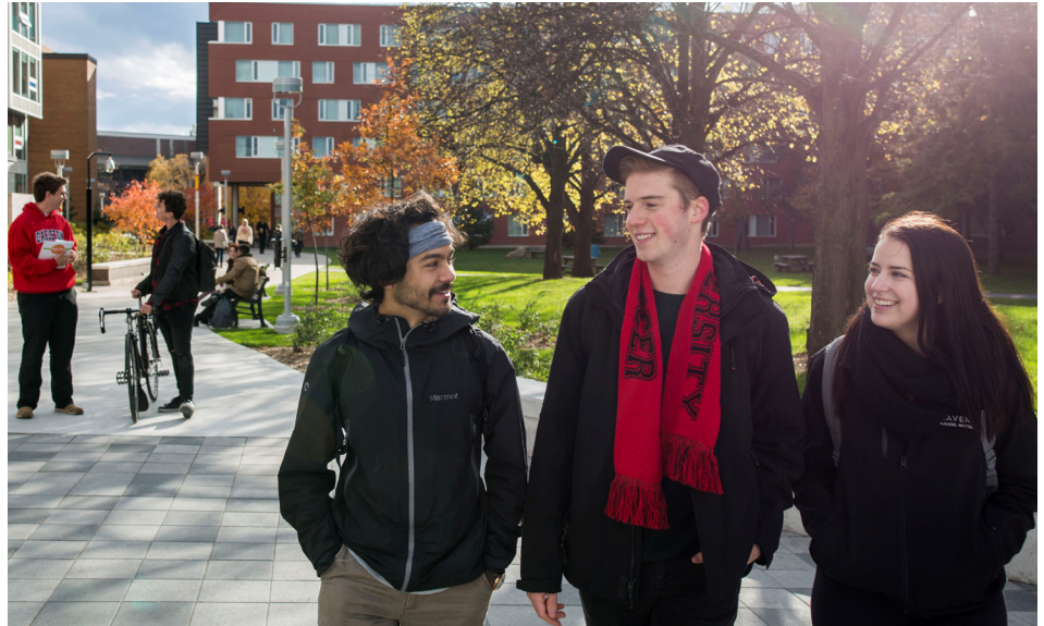
All of Carleton's residences are situated together, close to the heart of campus, making it easy to participate in residence activities or get to that early-morning class.

First year students living in residence will be enrolled in the All Access Meal Plan, which provides unlimited entry into the Dining Hall and $100 Dining 'Flex' Dollars. For students living in suite style residences, there is also a Reduced Meal Plan option, which offers seven meals per week and $450 Flex Dollars. The Residence Dining Hall sources food locally, accommodates dietary needs and offers an "all you care to eat" experience featuring a variety of meals cooked right in front of you. Visit housing.carleton.ca/fees-and-food for further information.