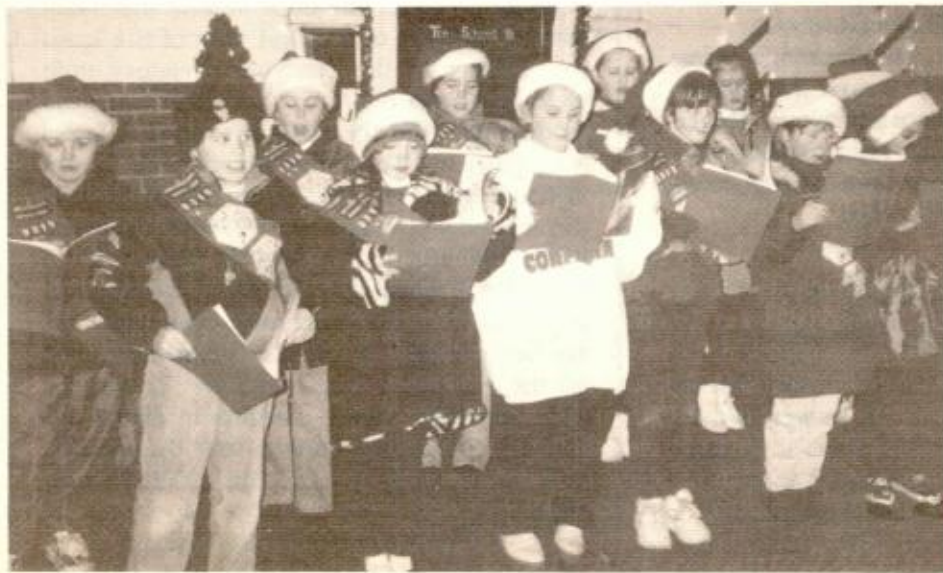
CHARLESTOWN BROWNIES, Girl Scout Troop #9315, sang Christmas carols through the streets of Charlestown just before the holidays. Also, the girls helped Townie Santa assemble and deliver gift packages to elderly, needy shut-ins, and they handed out refreshments and assisted at the Thompson Square tree-lighting ceremony.