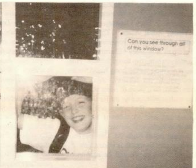
JANUARY TRIPS, one a ski trip to the Berkshires and the second an overnight camp-in at the Museum of Science, highlighted the club's Youth Program at