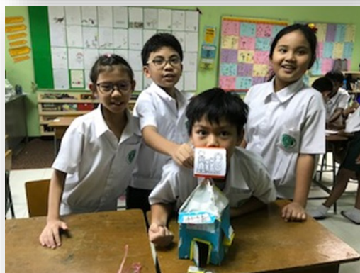
Science Activity by Grade 3 Bright Sparks