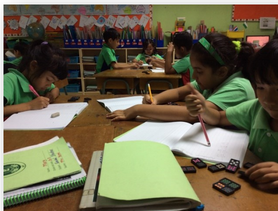
Math Activity using manipulatives by Grade 2 Eager Beaver