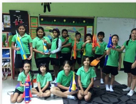
Language Arts Activity by Grade 5 Ace Achievers