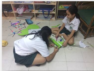
Language Arts Activity by Grade 5 Voyagers