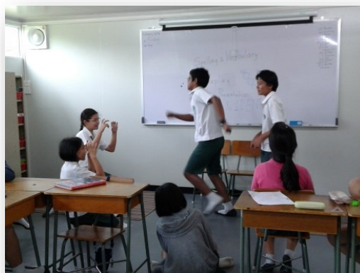
Fun and learning goes hand in hand in Grade 6 Classroom