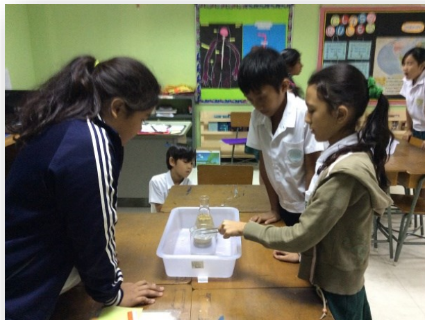
Science Activity on waves by Grade 5 Ace Achievers