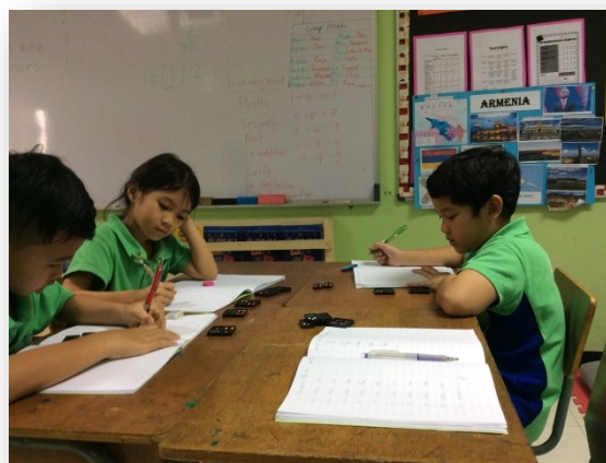
Math Activity using manipulatives by Grade 2 Eager Beaver