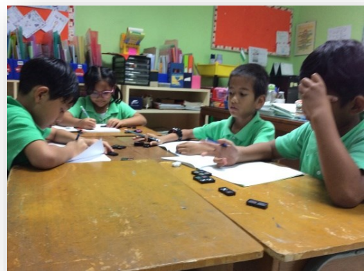
Math Activity using manipulatives by Grade 2 Eager Beaver