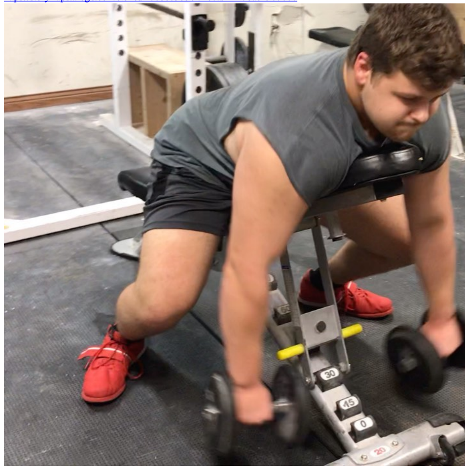
Primobolan Depot, those two words almost give me an orgasm every time I hear them. There are a lot of mixed reviews on Primo, most from newbies or guys who don't realize the true benefits of Primo. But take it from a vet and someone who is a true experienced Primo user, it's the shiznit... period.