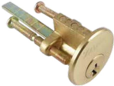
三開鎖膽，普通匙(金色) Rim Cylinder, Polished Brass Finish