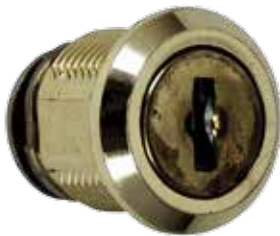
DIAGO 16MM信箱鎖(仿金) Cabinet Lock