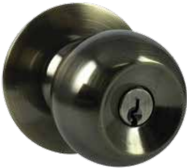
圓球門鎖，房門(青古色) Entrance Knob, Antique Brass Finish