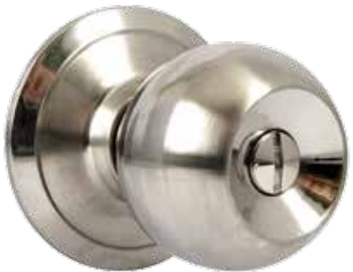
雙環圓球門鎖，浴室(沙鋼色) Privacy Knob, Satin S.S. Finish