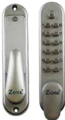
智易改按碼鎖(沙鐳色) Combination Push Button Lock, Satin Nickel Finish