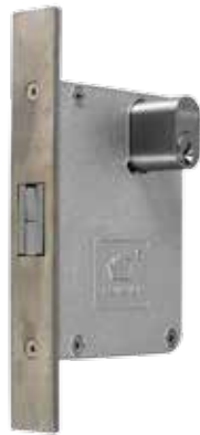
防盜鎖(雙勾) Latch Lock with Cylinder, Deadbolt