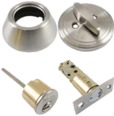
雙排珠電腦匙 (附加膽)套裝(沙鋼色) Cylinder with Dimple Key Deadbolt Set, Satin S.S. Finish