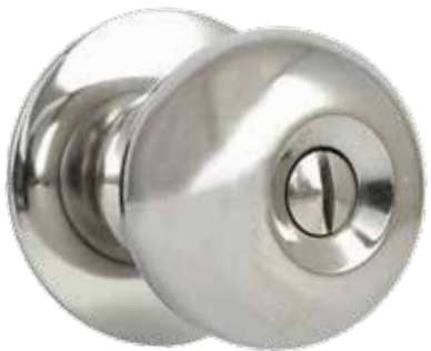
扁球門鎖，浴室(光叻) Privacy Knob, Polished Chrome Finish