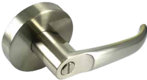
重裝三桿鎖，浴室(沙鐮色) Key-In Lever Set, Privacy Function, Satin Nickel Finish