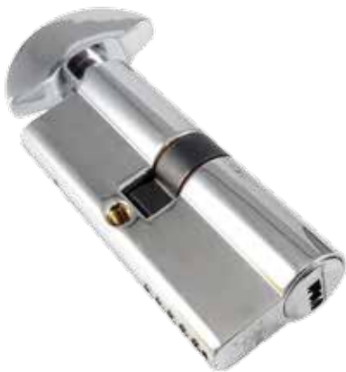
Z10 葫蘆膽76MM(電光絡) Euro Profile Cylinder, Polished Chrome Finish