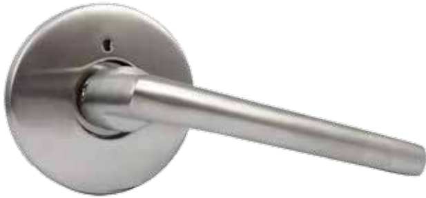
不銹鋼手抽，不含鎖舌(沙鋼色) Lever Handle, Satin S.S. Finish