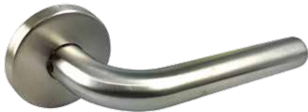
19MM不銹鋼手抽(沙鋼色) L Lever Handle, Satin S.S. Finish