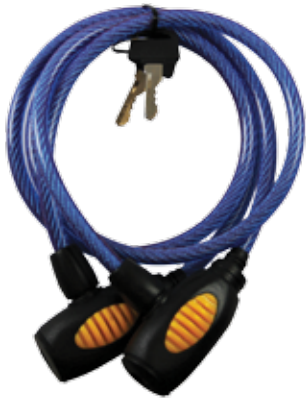
孖裝威也鎖 Wire Loop with Lock Twin Pack