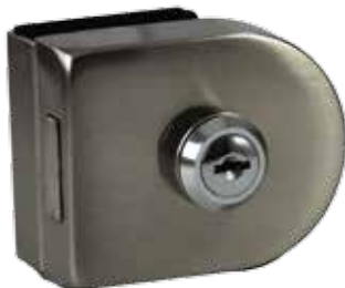
單直插牌(細) Patch Lock, Single Side, Small Size