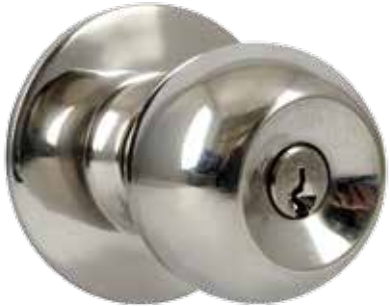
圓球門鎖，房門(光叻色) Entrance Knob, Polished Nickel Finish