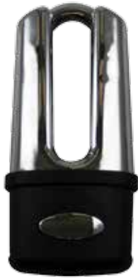
重裝防盜鎖 Security Lock