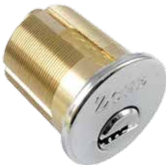
35mm雙排珠電腦匙螺絲膽(光鉻) Screw-In Cylinder, Polished Chrome Finish