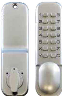
按制密碼鎖(沙鐳色) Push Button Lock, Satin Nickel Finish