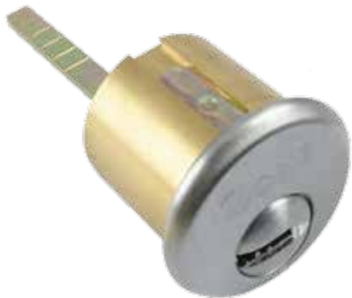
Z10 老虎膽(電沙絡) Cylinder, Satin Chrome Finish