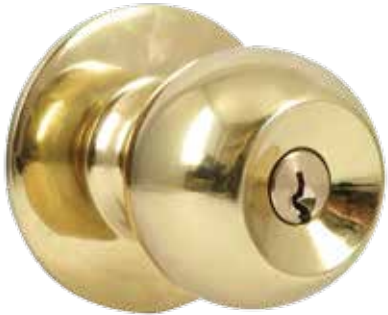
圓球門鎖，房門(銅拋光) Entrance Knob, Polished Brass Finish