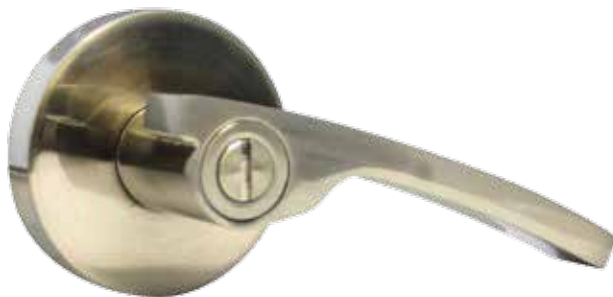
重裝三桿鎖，浴室(沙鐳色) Key-In Lever Set, Privacy Function, Satin Nickel Finish