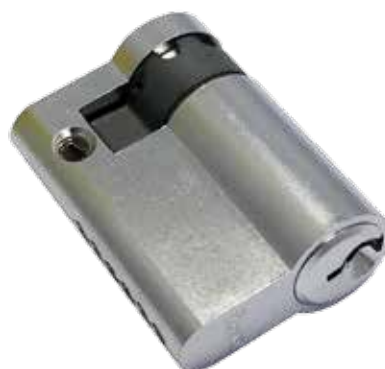
45MM半邊葫蘆膽 Euro Profile Single Cylinder