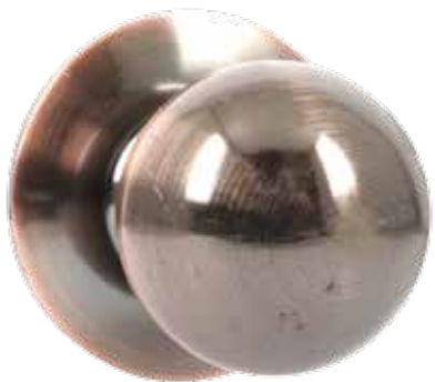
圓球門鎖，通道(紅古色) Passage Knob, Antique Copper Finish