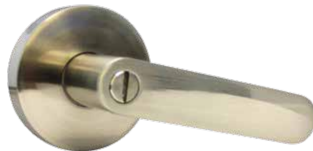
重裝三桿鎖，浴室(沙鐳色) Key-In Lever Set, Privacy Function, Satin Nickel Finish