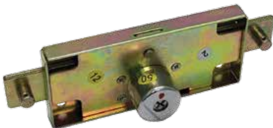
防鑽捲閘鎖 Shutter Lock