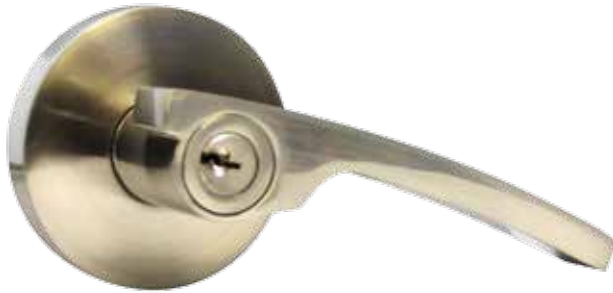
重裝三桿鎖(沙鐳色) Key-In Lever Set, Satin Nickel Finish