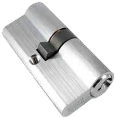
65MM雙膽葫蘆膽(沙鉻色) Euro Profile Double Cylinder, Satin Chrome Finish