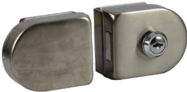
雙勾牌(細) Patch Lock, Both Sides, Small Size