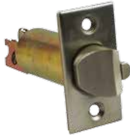
重裝Deadbolt 70斜舌 Latch