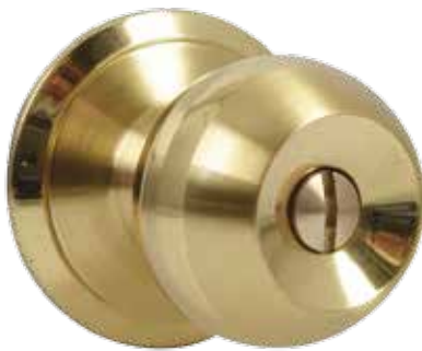
雙環圓球門鎖，浴室(銅拋光) Privacy Knob, Polished Brass Finish