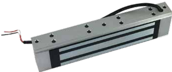
300磅電磁力鎖 300lbs Magnet 12/24 VDC-Surface