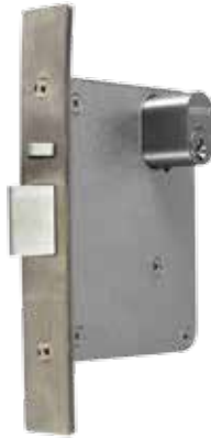
趙門鎖(斜舌) Latch Lock with Cylinder