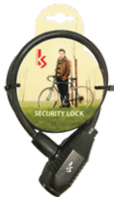
威也鎖 TY421 8x650MM Security Lock Chain