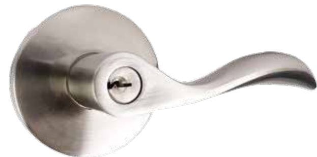
重裝三桿鎖，右手(沙鐳色) Key-In Lever Set, Right Handed, Satin Nickel Finish