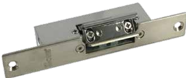
玻璃門專用夾 Electric Strike for Glass Door