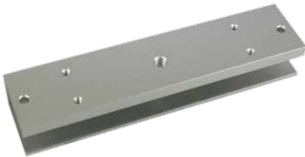
U型磁力鎖玻璃門專用支架(280KG) U Shape Glass Patch