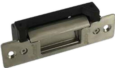
美式堅固型信號電鎖 Electric Strike (Fail Safe)