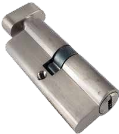
70MM細葫蘆膽 Small Size Euro Profile Cylinder