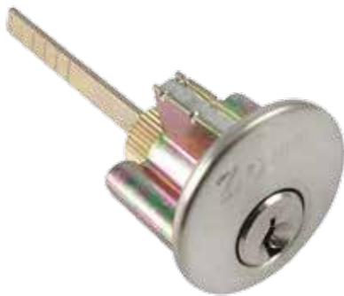
附加鎖膽(沙鋼色) Cylinder, Satin Nickel Finish