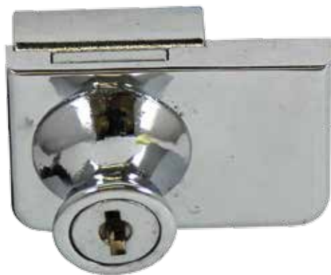
DIAGO 玻璃鎖 Glass Lock