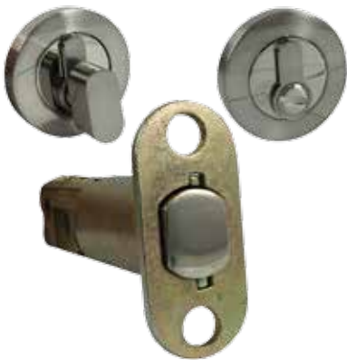
70MM葫蘆膽型插芯，浴室(沙鋼色) Cylinder with Deadbolt Set, Privacy Function Satin Nickel Finish