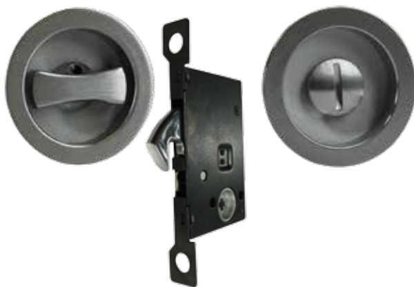
圓形趟門勾鎖(沙銻色) Sliding Door Privacy Lock, Satin Chrome Finish