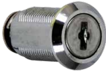
DIAGO 30MM信箱鎖 Cabinet Lock