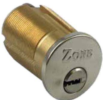
35MM電腦匙鑲絲膽(沙鍍) Screw in Cylinder with Dimple Key, Satin Nickel Finish