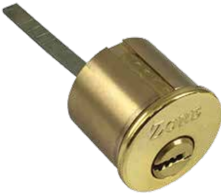
雙排珠電腦匙，附加膽(銅拋光) Cylinder with Dimple Key Set, Polished Brass Finish