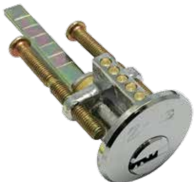
SCP電腦匙三開膽(銀色) Rim Cylinder with Dimple Key, Polished Chrome Finish