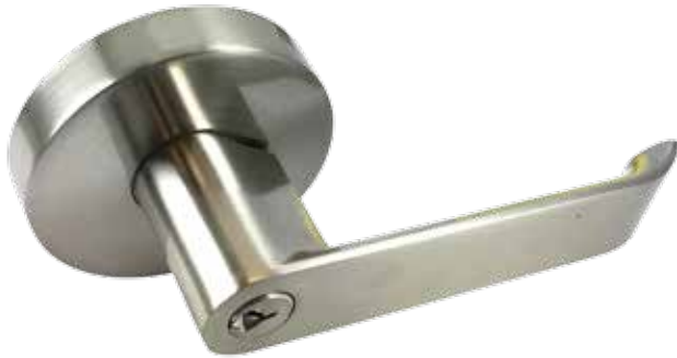
重裝三桿鎖(沙鐳色) Key-In Lever Set, Satin Nickel Finish