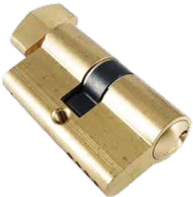
54MM手扭葫蘆膽(沙金) Euro Profile Cylinder and Turn, Satin Brass Finish