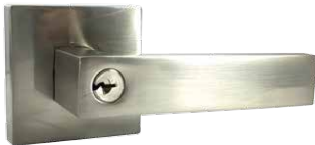
重裝三桿鎖(沙鐮色) Key-In Lever Set, Satin Nickel Finish