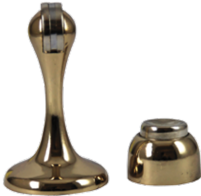
合金強磁門吸(銅拋光) Magnetic Door Holder, Polished Brass Finish