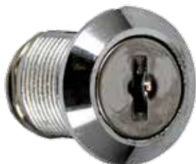
DIAGO 20MM信箱鎖 Cabinet Lock