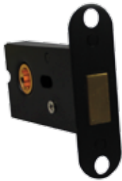
不銹鋼廁所指示門舌 Latch With Indicator