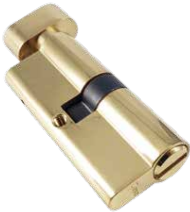
70MM單邊隋圓形浴室手扭葫蘆膽(銅拋光) Euro Prviacy Cylinder with Turn, Polished Brass Finish