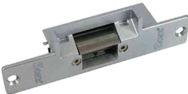
標準式電鎖口(斷電開) Electric Strike (NO)