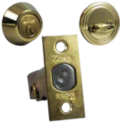
普通匙附加鎖套裝(銅拋光) Cylinder with Flat Key Deadbolt Set, Polished Brass Finish