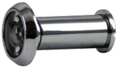
門眼(光鉻) Door Viewer, Polished Chrome Finish