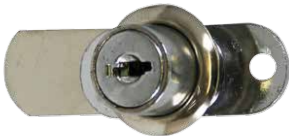
DIAGO 抽屜鎖 Cabinet Lock