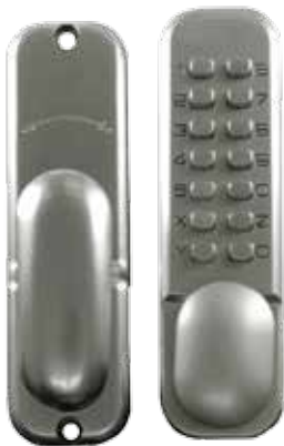
按碼鎖(沙鐳色) Push Button Lock, Satin Nickel Finish