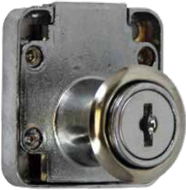
DIAGO 22MM方舌免鑿柜鎖 Cabinet Lock