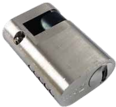
45MM電腦匙半邊大鵝蛋 Oval Profile Single Cylinder with Dimple Key, Satin Nickel Finish