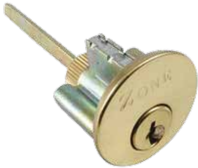
附加鎖膽(金色) Cylinder, Polished Brass Finish