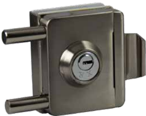
玻璃鎖牌 Patch Lock