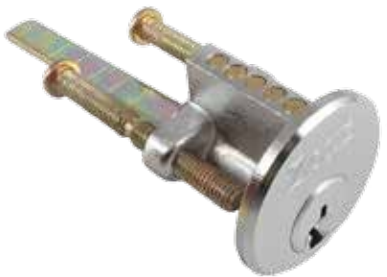
三開鎖膽，普通匙(沙鎳色) Rim Cylinder, Satin Chrome Plated Finish