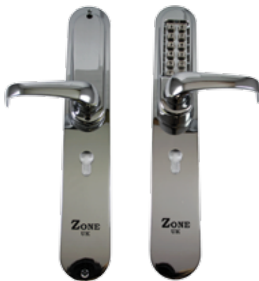
大門長面板密碼鎖(光鉻) Push Button Lock with Long Plate Polished Chrome Finish