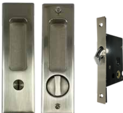
趟門勾鎖，房門(銀色) Sliding Door Privacy Lock (Silver)