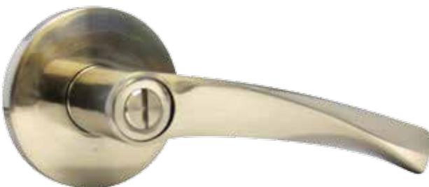
重裝三桿鎖，浴室(沙鐳色) Key-In Lever Set, Privacy Function, Satin Nickel Finish