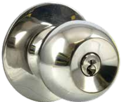
圓球門鎖，士多(光叻色) Storeroom Knob, Polished Nickel Finish