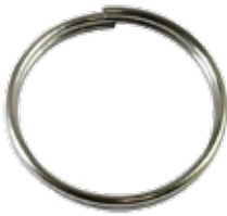
匙圈 Key Ring