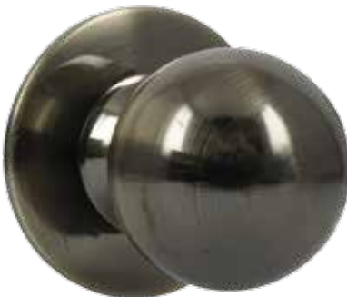
圓球門鎖，通道(青古色) Passage Knob, Antique Brass Finish