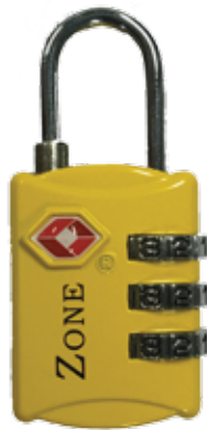
TSA 28MM合金密碼鎖(黃色) Combination Lock with Wire Loop YELLOW