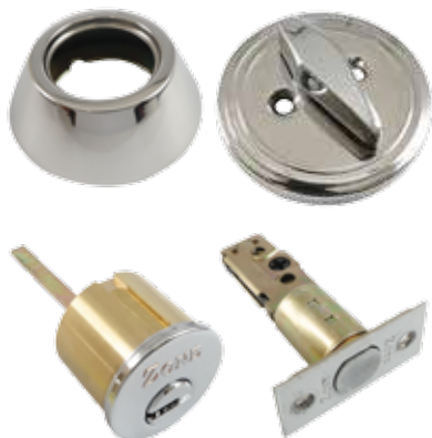
雙排珠電腦匙 (附加膽)套裝(光叻) Cylinder with Dimple Key Deadbolt Set, Polished Chrome Finish