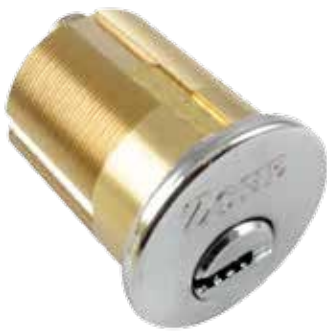
38mm雙排珠電腦匙螺絲膽(光鉻) Screw-In Cylinder, Polished Chrome Finish