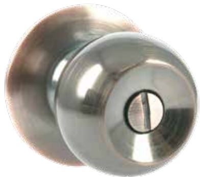
圓球門鎖，浴室(紅古色) Privacy Knob, Antique Copper Finish