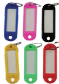
鎖匙牌 Key Tag