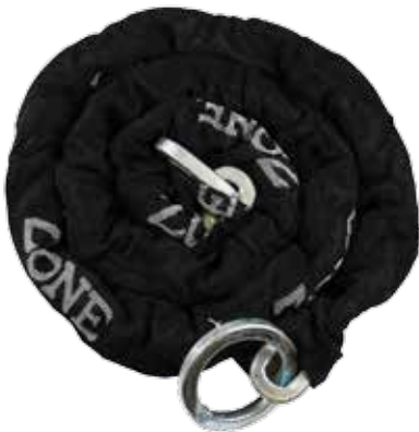
新款防盜2米鋼鏈 Lock Chain