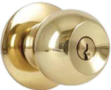
圓球門鎖，士多(銅拋光) Storeroom Knob, Polished Brass Finish