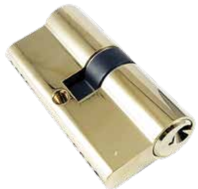
64MM雙膽葫蘆膽(金色) Euro Profile Cylinder and Turn, Satin Nickel Finish