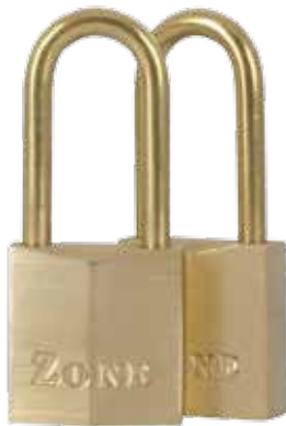
20MM同匙銅掛鎖,1X2 Brass Padlock with KA