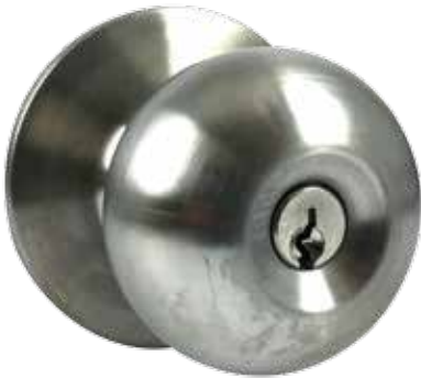
扁球門鎖，房門(沙鋼色) Entrance Knob, Satin S.S. Finish