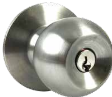
圓球門鎖，士多(沙鋼色) Storeroom Knob, Satin S.S. Finish