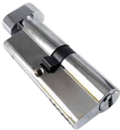
80MM雙排珠電腦匙手扭葫蘆膽(光鍍色) Euro Profile Cylinder and Turn, Polished Chrome Finish