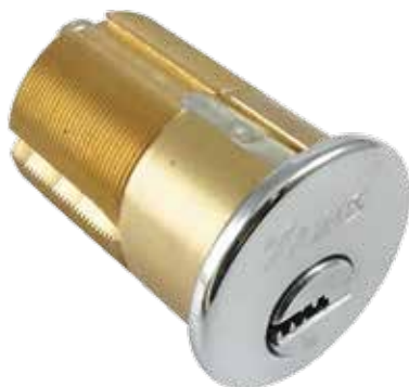
Z10 1-6/8"螺絲膽(光叻) Screw-In Cylinder, Polished Chrome Finish