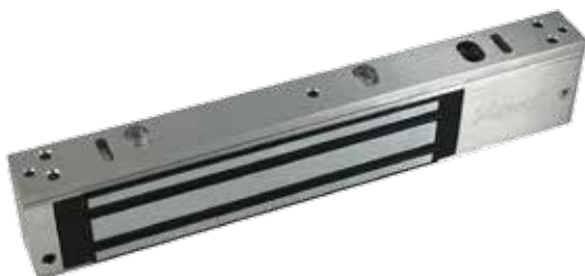
600磅電磁力鎖 600lbs Magnet 12/24 VDC with Sensor & Led-Surface