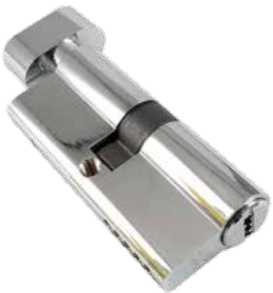
70MM雙排珠電腦匙手扭葫蘆(光鉻色) Euro Profile Cylinder and Turn, Polished Chrome Finish