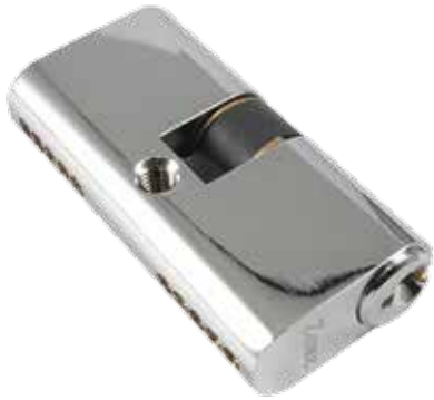
55MM同匙意式雙膽細鵝膽，窄腳 Small Size Oval Profile Cylinder, with KA