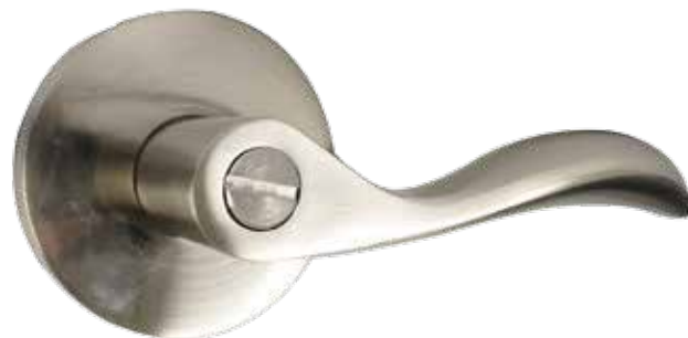
重裝三桿鎖，浴室，右手(沙鐳色) Key-In Lever Set, Privacy Function, Right Handed, Satin Nickel Finish