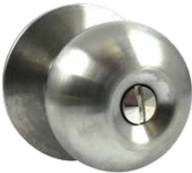
圓球門鎖，浴室(沙鋼色) Privacy Knob, Satin S.S. Finish