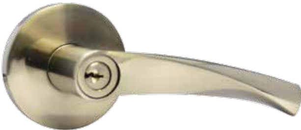
重裝三桿鎖(沙鐳色) Key-In Lever Set, Satin Nickel Finish