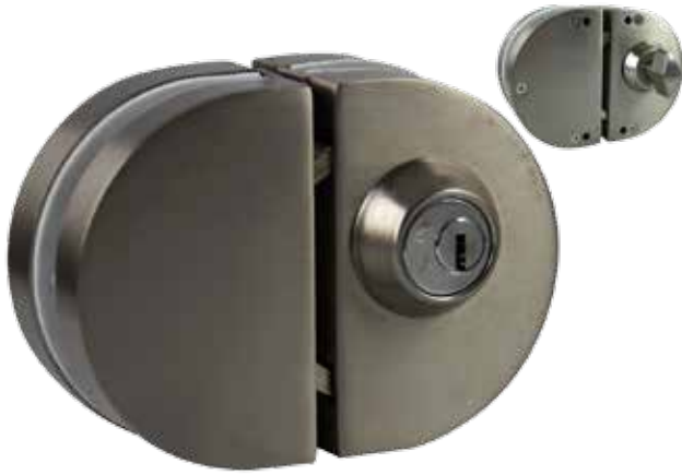
手扭玻璃鎖牌(XE118) Patch Lock with Turn