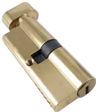
76MM雙排珠電腦匙手扭葫蘆膽(銅拋光) Euro Profile Cylinder and Turn, Polished Brass Finish