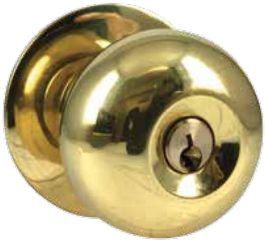
扁球門鎖，房門(銅拋光色) Entrance Knob, Polished Brass Finish