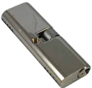
80MM細鵝膽 Small Size oval Profile Cylinder