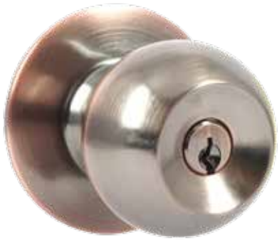
圓球門鎖，房門(紅古色) Entrance Knob, Antique Copper Finish