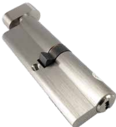
100MM電腦匙手扭葫蘆膽(沙鍍色) Euro Profile Cylinder and Turn, Satin Nickel Finish