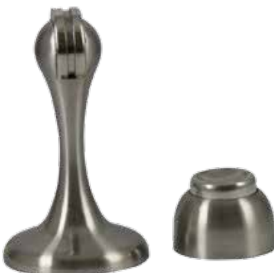
合金強磁門吸(沙鐳色) Magnetic Door Holder, Satin Nickel Finish