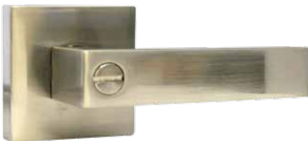
重裝三桿鎖，浴室(沙鐮色) Key-In Lever Set, Privacy Function, Satin Nickel Finish