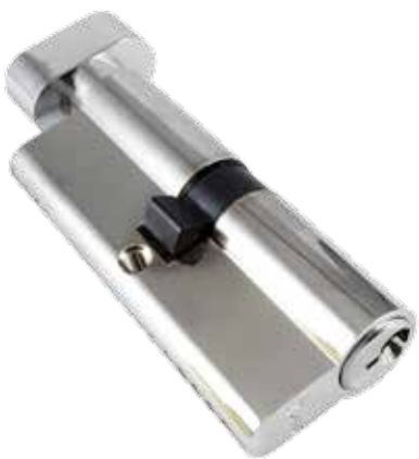
76MM單邊T04橢圓形扭手葫蘆膽(沙鍍色) Euro Profile Cylinder and Turn, Satin Nickel Finish