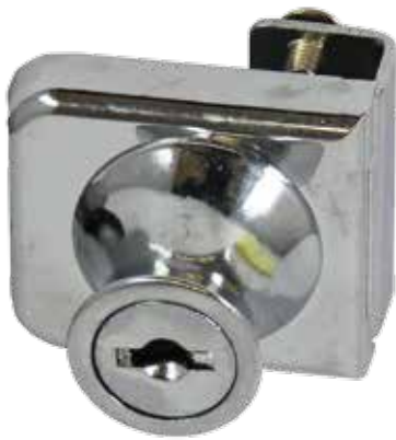
DIAGO 玻璃鎖 Glass Lock