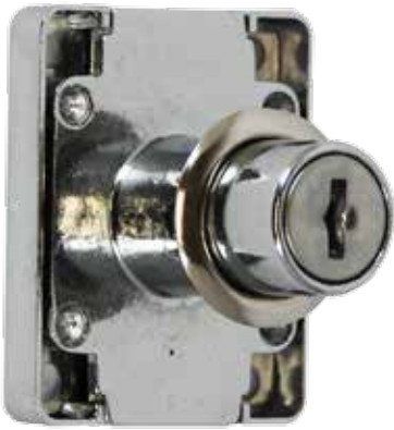
DIAGO 長套雙舌抽屜鎖 Cabinet Lock