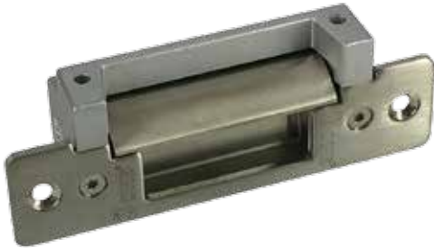
美式堅固型信號電鎖 Electric Strike (Fail Secure)