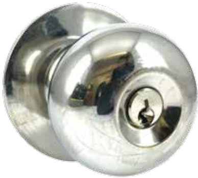
扁球門鎖，房門(光叻) Entrance Knob, Polished Chrome Finish