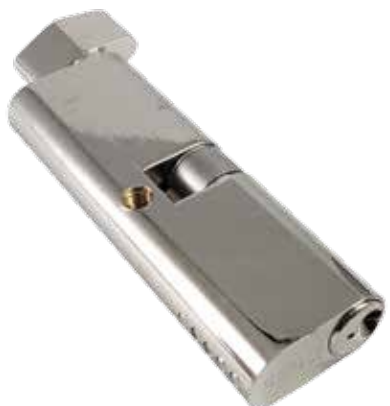
80MM手扭細鵝膽 Small Size Oval Profile Cylinder and Turn