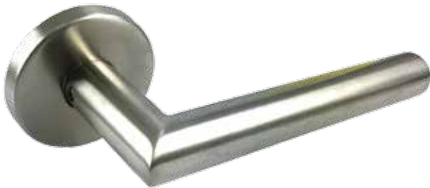
19MM不銹鋼手抽(沙鋼色) L Lever Handle, Satin S.S. Finish