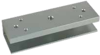
U型磁力鎖玻璃門專用支架(180KG) U Bracket for Glass Door