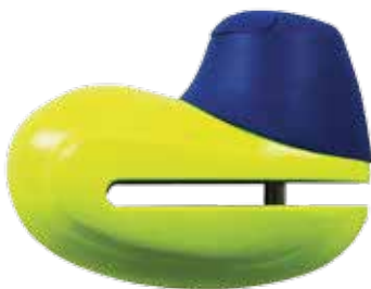
中碟鎖 Brake Disc Lock