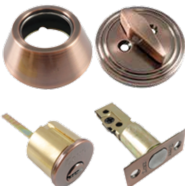
雙排珠電腦匙 (附加膽)套裝(紅古色) Cylinder with Dimple Key Deadbolt Set, Antique Copper Finish