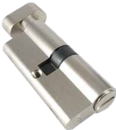
70MM單邊隋圓形浴室手扭葫蘆膽(沙鍍色) Euro Privacy Cylinder with Turn, Satin Nickel Finish