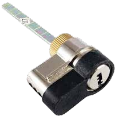
電腦匙插芯鎖膽(沙鐳色) Cylinder with Dimple Key, Satin Nickel Finish