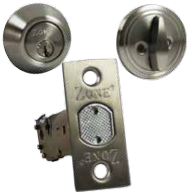
普通匙附加鎖套裝(沙鋼色) Cylinder with Flat Key Deadbolt Set, Satin Nickel Finish