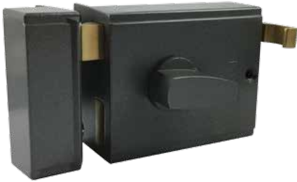
ZONE 1332T 三開鎖不連匙膽 Rim Nighlatch Lock without Cylinder