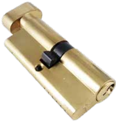
76MM單邊T04橢圓形扭手葫蘆膽(銅拋光) Euro Profile Cylinder and Turn, Polished Brass Finish