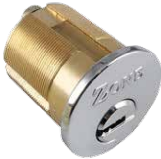
35MM電腦匙鑲絲膽 Screw in Cylinder with Dimple Key, Polished Chrome Finish