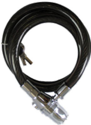
摩托車報警鋼絲鎖 Motorcycle Lock