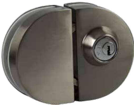
圓形玻璃鎖牌 Round Patch Lock