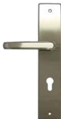
方型不銹鋼面板套裝，未計鎖膽及鎖體 SS Handle Set, Without Lockcase and Cylinders