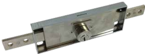
捲閘鎖 Shutter Lock