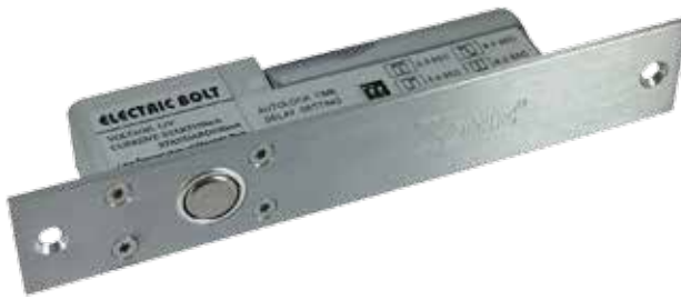
電插恤連指示燈(斷電開) Electric Dropbolt Fail Safe with Magnetic Status