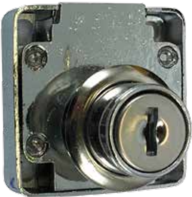
DIAGO 22MM斜口免鑿柜鎖 Cabinet Lock