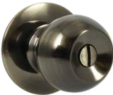
圓球門鎖，浴室(青古色) Privacy Knob, Antique Brass Finish