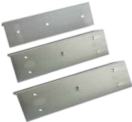
Z1型磁力鎖專用多功能支架 Multi-Functional Bracket