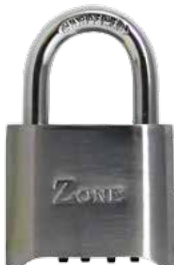
50MM底撥4珠銅密碼鎖(銀色) Combination Lock