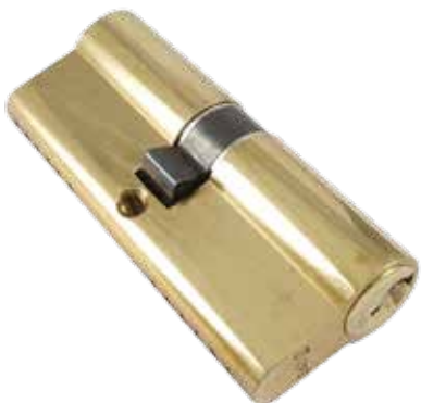
76MM普通匙葫蘆膽(金色) Euro Profile Cylinder, Polished Brass Finish