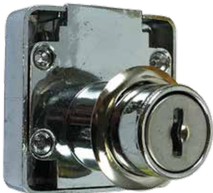
DIAGO 32MM斜口免鑿柜鎖 Cabinet Lock