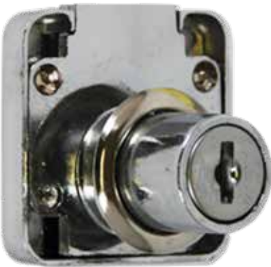
DIAGO 26MM方舌免鑿柜鎖 Cabinet Lock