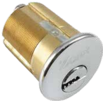
Z10 1-1/2"螺絲膽(光叻) Screw-In Cylinder, Polished Chrome Finish