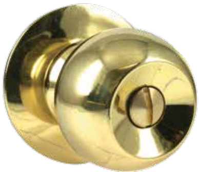
圓球門鎖，浴室(銅拋光) Privacy Knob, Polished Brass Finish