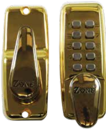
2700迷你密碼鎖(金色) Combination Lock, Polished Brass Finish