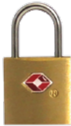
TSA 22MM銅身掛鎖 Brass Pad Lock