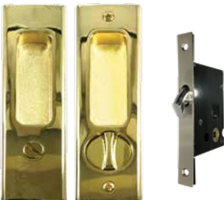
趟門勾鎖，廁所(金色) Sliding Door Privacy Lock (Gold)