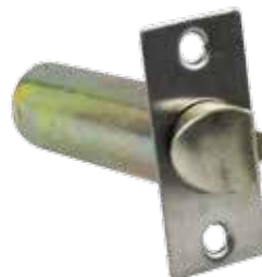
90mm房門鎖舌(沙鋼色) Latch, Satin S.S. Finish