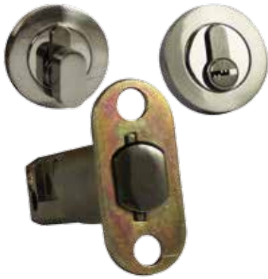
70MM葫蘆膽型插芯(沙鋼色) Cylinder with Flat Key Deadbolt Set, Satin Nickel Finish