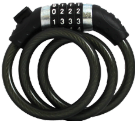
40MK 12X800MM威也密碼鎖 Wire Loop with Combination Lock