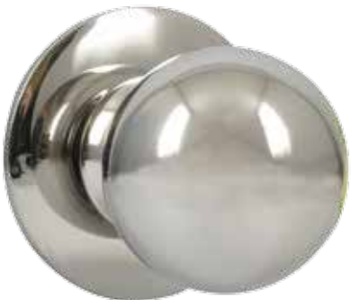
圓球門鎖，通道(光叻色) Passage Knob, Polished Nickel Finish