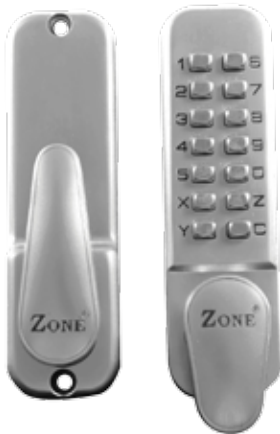
70MM 有制按碼鎖(沙鐳色) Combination Push Button Lock, Satin Nickel Finish