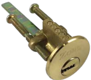
電腦匙三開膽(金色) Rim Cylinder with Dimple Key, Polished Brass Finish