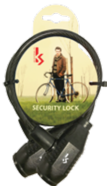
孖裝威也鎖 TY421x2 8x650MM Security Lock Chain Twin Pack with Key Alike