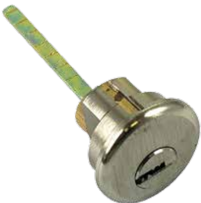
電腦匙插芯鎖膽(沙鐮色) Cylinder with Dimple Key, Satin Nickel Finish