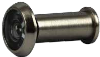
門眼(沙鎳) Door Viewer, Satin Nickel Finish