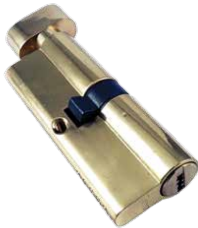
80MM雙排珠電腦匙手扭葫蘆膽(銅拋光) Euro Profile Cylinder and Turn, Polished Brass Finish