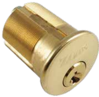
38MM普通匙螺絲膽(銅拋光) Screw-In Cylinder, Polished Brass Finish