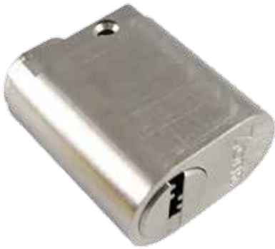
半邊鵝膽 Oval Profile Single Cylinder, Satin Nickel Finish