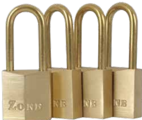
20MM同匙銅掛鎖,1X4 Brass Padlock with KA