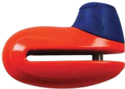
大碟鎖 Brake Disc Lock