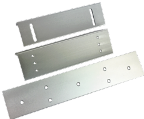
Z型磁力鎖配件 Z Bracket for EM560