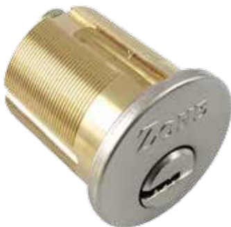
35mm雙排珠電腦匙螺絲膽(沙鐳色) Screw-In Cylinder, Satin Nickel Finish