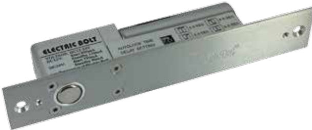
電插恤(斷電開) Electric Dropbolt Fail Safe