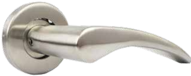
不銹鋼手抽(沙鋼色) Lever Handle, Satin S.S. Finish