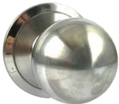
雙環圓球門鎖，通道(沙鋼色) Passage Knob, Satin S.S. Finish