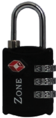
TSA 28MM合金密碼鎖(黑色) Combination Lock with Wire Loop BLACK