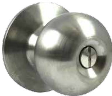
扁球門鎖，浴室(沙鋼色) Privacy Knob, Satin S.S. Finish