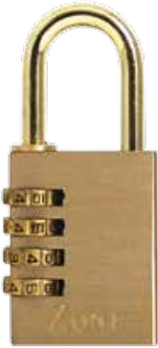
40MM銅身密碼鎖(金色) Combination Lock