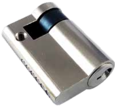
45MM半邊葫蘆膽，工程用0號珠(沙鍍色) Euro Profile Single Cylinder, Satin Nickel Finish