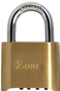
50MM底撥4珠密碼鎖(沙金) Combination Lock