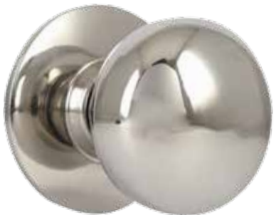
扁球門鎖，通道(光叻) Passage Knob, Polished Chrome Finish