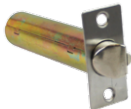
127mm房門鎖舌(沙鋼色) Latch, Satin S.S. Finish