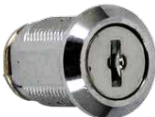
DIAGO 25MM信箱鎖 Cabinet Lock