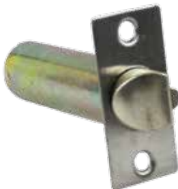
100mm房門鎖舌(沙鋼色) Latch, Satin S.S. Finish