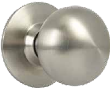
扁球門鎖，通道(沙鋼色) Passage Knob, Satin S.S. Finish