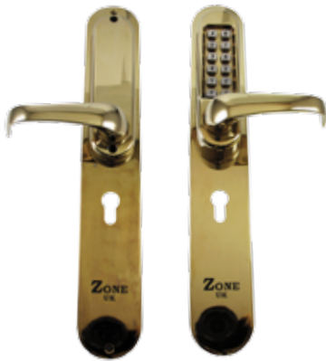
大門長面板密碼鎖(金色) Push Button Lock with Long Plate, Gold Finish