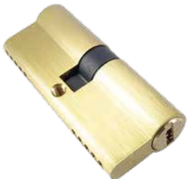
75MM雙排珠電腦匙葫蘆膽，雙膽(沙金) Euro Profile Double Cylinder, Satin Brass Finish