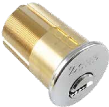
46mm雙排珠電腦匙螺絲膽(光鉻) Screw-In Cylinder, Polished Chrome Finish