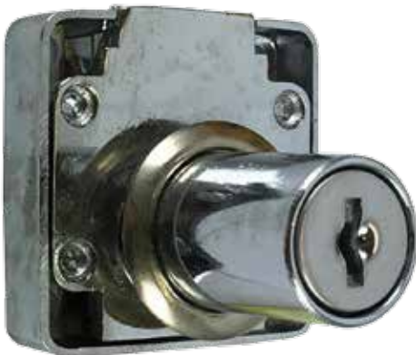
DIAGO 26MM斜口免鑿柜鎖 Cabinet Lock