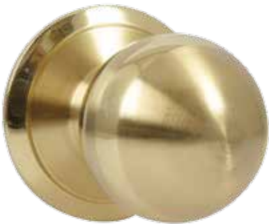
雙環圓球門鎖，通道(銅拋光) Passage Knob, Polished Brass Finish