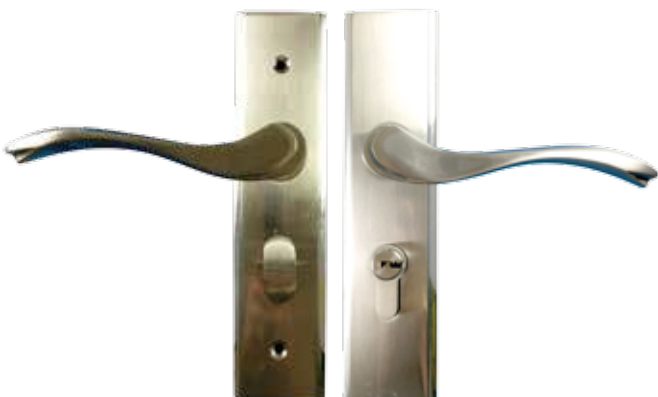
插芯鎖(沙鐳色) Lever Lock Set, Satin Nickel Finish