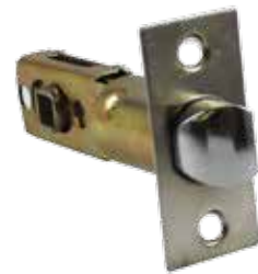
60/70伸縮舌 Latch for 60/70 BS