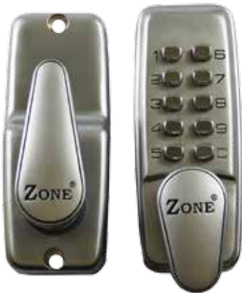
2700迷你密碼鎖(沙鐳色) Combination Lock, Satin Nickel Finish