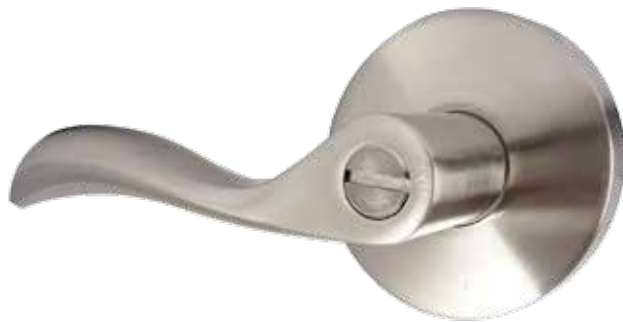
重裝三桿鎖，浴室，左手(沙鐳色) Key-In Lever Set, Privacy Function, Left Handed, Satin Nickel Finish