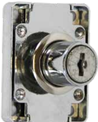
DIAGO 短套雙舌抽屜鎖 Cabinet Lock