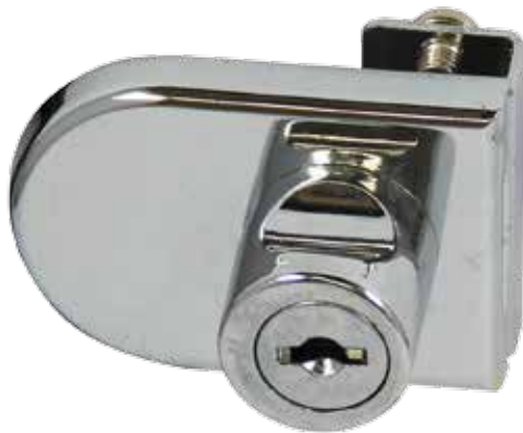
DIAGO 玻璃鎖 Glass Lock