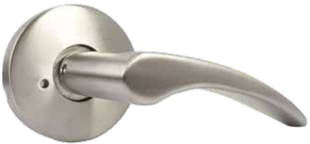
不銹鋼手抽，不含鎖舌(沙鋼色) Lever Handle, Satin S.S. Finish