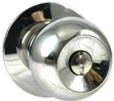
圓球門鎖，浴室(光叻色) Prviacy Knob, Polished Nickel Finish