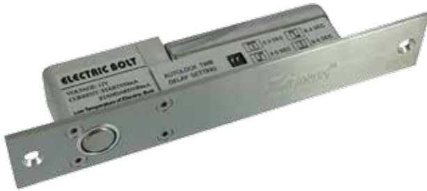
電插恤(斷電開) Economic Electric Dropbolt Fail Safe