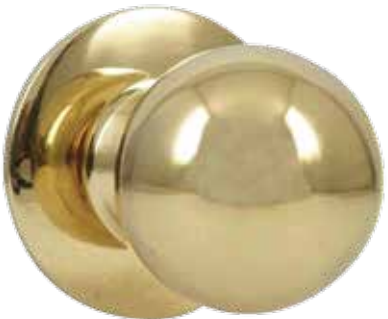
圓球門鎖，通道(銅拋光) Passage Knob, Polished Brass Finish