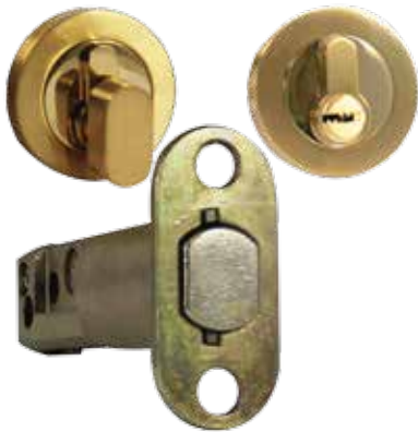
70MM葫蘆膽型插芯(銅拋光) Cylinder with Flat Key Deadbolt Set, Polished Brass Finish