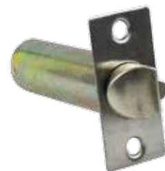
85mm房門鎖舌(沙鋼色) Latch, Satin S.S. Finish