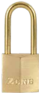
20MM同匙銅掛鎖 Brass Padlock with KA