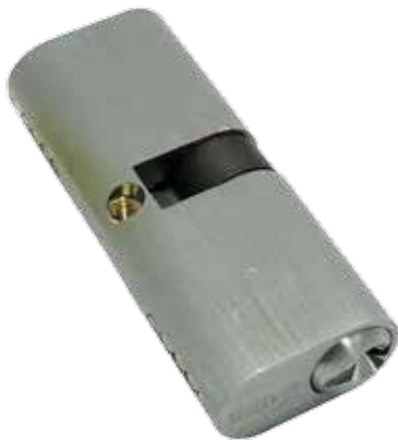
76MM大鵝蛋雙膽 Oval Profile Double Cylinder