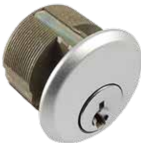
29MM鋅合金鑲絲膽(沙鍍色) Screw-In Cylinder, Satin Nickel Finish