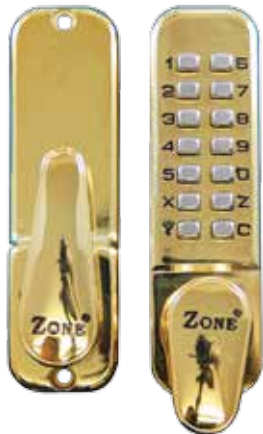
70MM 有制按碼鎖(金色) Combination Push Button Lock, Polished Brass Finish