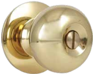
扁球門鎖，浴室(銅拋光色) Bathroom Knob, Polished Brass Finish