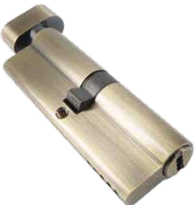
90MM電腦匙手扭葫蘆膽(青古色) Euro Profile Cylinder and Turn, Antique Brass Finish