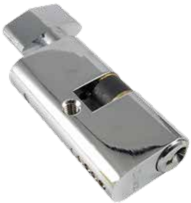
55MM意式手扭細鵝膽，窄腳 Small Size Oval Profile Cylinder and Turn