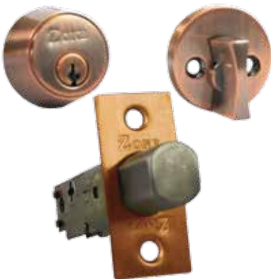
附加鎖套裝(紅古色) Cylinder with Flat Key Deadbolt Set, Antique Copper Finish