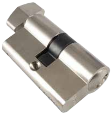
54MM手扭葫蘆膽(沙叻) Euro Profile Cylinder and Turn, Satin Nickel Finish