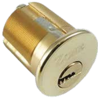
Z10 1-3/8"螺絲膽(PVD) Screw-In Cylinder, PVD Finish