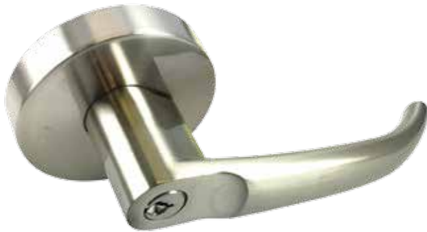
重裝三桿鎖(沙鐮色) Key-In Lever Set, Satin Nickel Finish