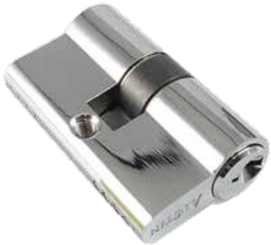
52MM雙膽葫蘆膽(光叻色) Euro Profile Double Cylinder, Polished Chrome Finish