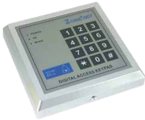
密碼制盤 Digital Keypad