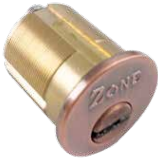
38MM電腦匙鑲絲膽(紅古色) Screw in Cylinder with Dimple Key, Antique Copper Finish