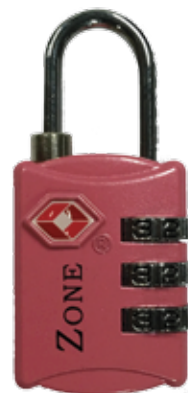
TSA 28MM合金密碼鎖(粉紅色) Combination Lock with Wire Loop PINK