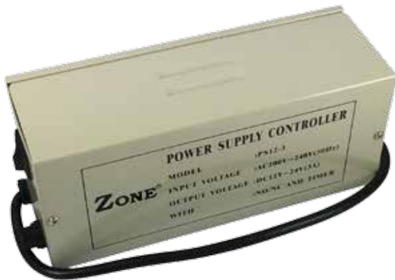
PS12-3火牛(12/24VDC, 3MA) Transformer