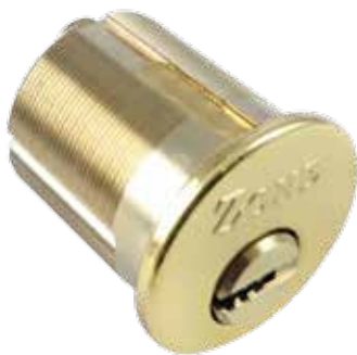
35mm雙排珠電腦匙螺絲膽(銅拋光) Screw-In Cylinder, Polished Brass Finish