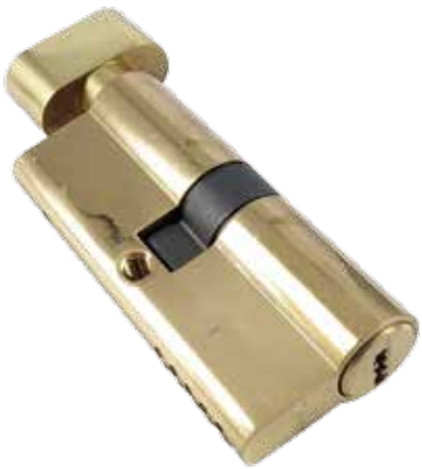
70MM雙排珠電腦匙手扭葫蘆膽(銅拋光) Euro Profile Cylinder and Turn, Polished Brass Finish