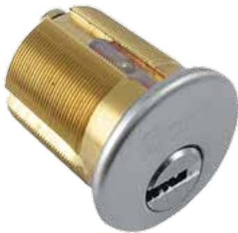
Z10 1-3/8"螺絲膽(電沙絡) Screw-In Cylinder, Satin Chrome Finish