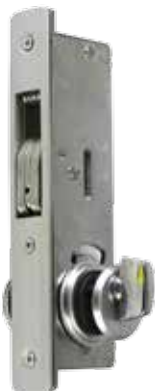
鋁門勾鎖 Hook Lock