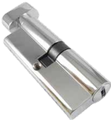
80MM電腦匙手扭葫蘆膽(光鉻色) Euro Profile Cylinder and Turn with Dimple Key, Polished Chrome Finish