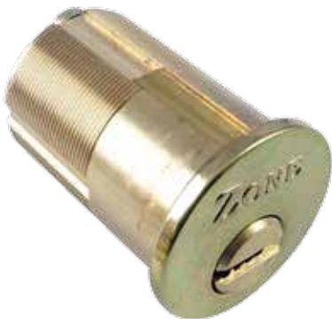
45mm雙排珠電腦匙螺絲膽(銅拋光) Screw-In Cylinder, Polished Brass Finish