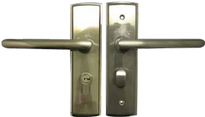
插芯鎖(沙鐳色) Lever Lock Set, Satin Nickel Finish