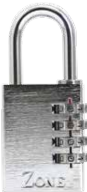
40MM電鍍密碼鎖(銀色) Combination Lock