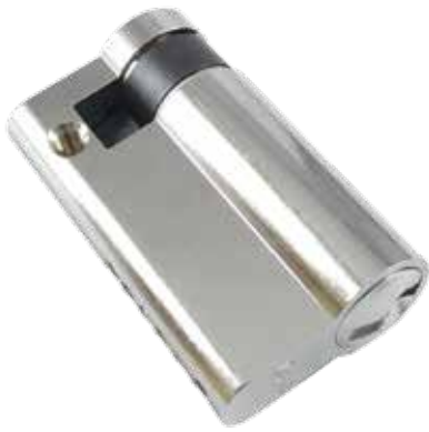
55MM半邊六珠葫蘆膽(沙鍍色) 55mm Euro Profile Single Cylinder, Satin Chrome Finish