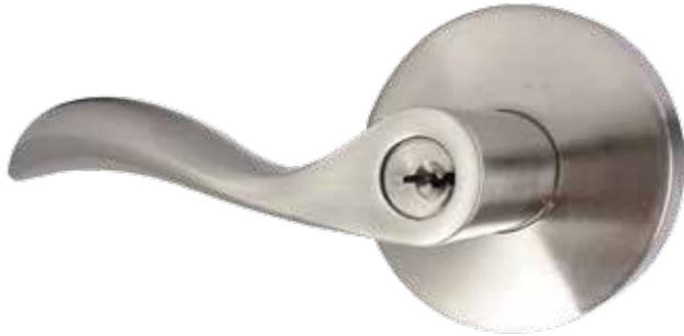
重裝三桿鎖，左手(沙鐳色) Key-In Lever Set, Left Handed, Satin Nickel Finish