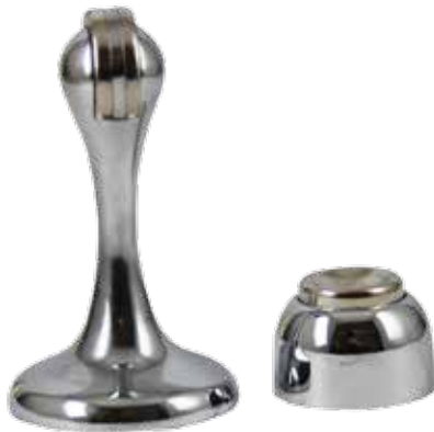
合金強磁門吸(光叻色) Magnetic Door Holder, Polished Chrome Finish