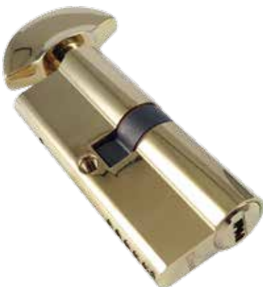
Z10 葫蘆膽76MM(PVD) Euro Profile Cylinder, PVD Finish