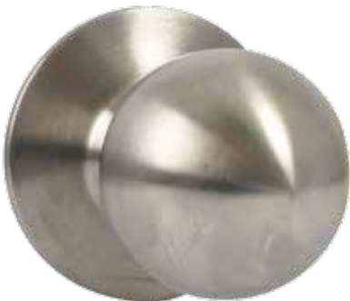
圓球門鎖，通道(沙鋼色) Passage Knob, Satin S.S. Finish