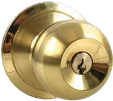
雙環圓球門鎖，房門(銅拋光) Entrance Knob, Polished Brass Finish