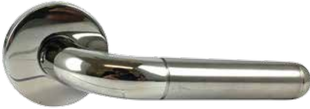
不銹鋼手抽(沙鋼色) Lever Handle, Satin S.S. Finish