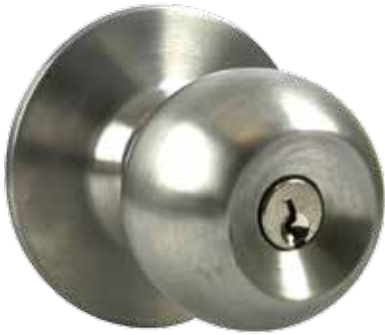
圓球門鎖，房門(沙鋼色) Entrance Knob, Satin S.S. Finish