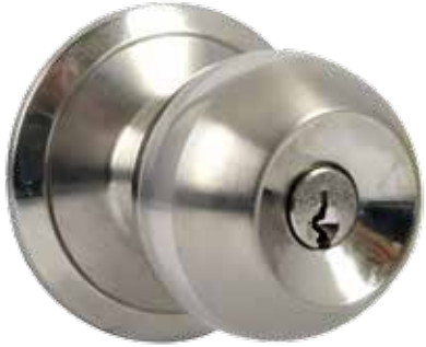
雙環圓球門鎖，房門(沙鋼色) Entrance Knob, Satin S.S. Finish