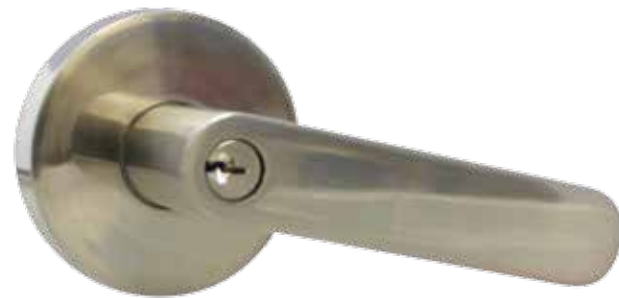
重裝三桿鎖(沙鐳色) Key-In Lever Set, Satin Nickel Finish