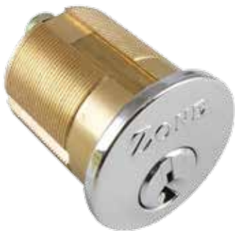
35MM普通匙螺絲膽(光叻) Screw-In Cylinder, Polished Chrome Finish