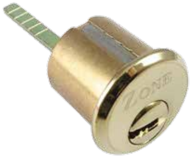
Z10 老虎膽(金色) Cylinder, PVD Finish