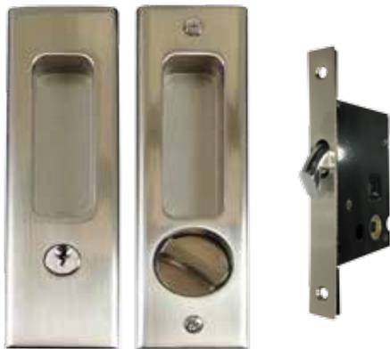
趟門勾鎖(銀色) Sliding Door Lock (Silver)