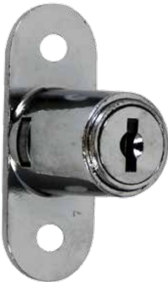
DIAGO 趟門按鎖 Cabinet Lock