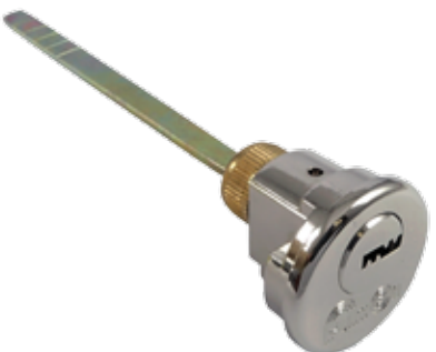
電腦匙附加膽(光鉻色) Cylinder with Dimple Key, Polished Chrome Finish