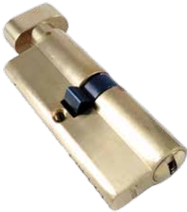
80MM電腦匙手扭葫蘆膽(銅拋光) Euro Profile Cylinder and Turn with Dimple Key, Polished Brass Finish