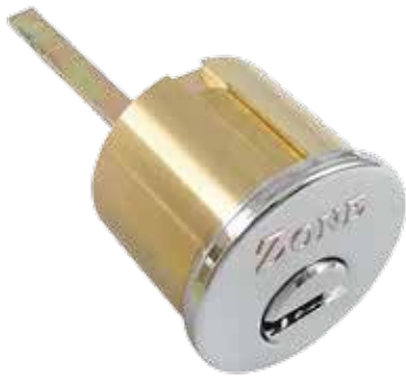
雙排珠電腦匙，附加膽(光鉻) Cylinder with Dimple Key Set, Polished Chrome Finish