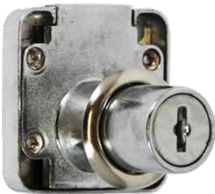
DIAGO 32MM方舌免鑿柜鎖 Cabinet Lock