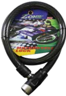
粗身大威也鎖 Wire Loop With Lock