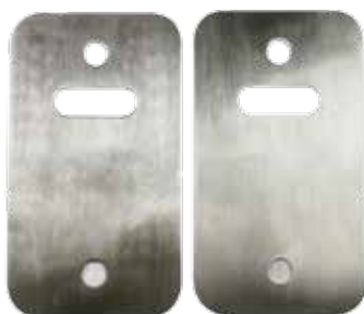
304不銹鋼門鎖片 Satin S.S. Plate