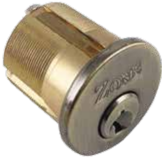
32MM普通匙螺絲膽(青古色) Screw-In Cylinder, Antique Brass Finish