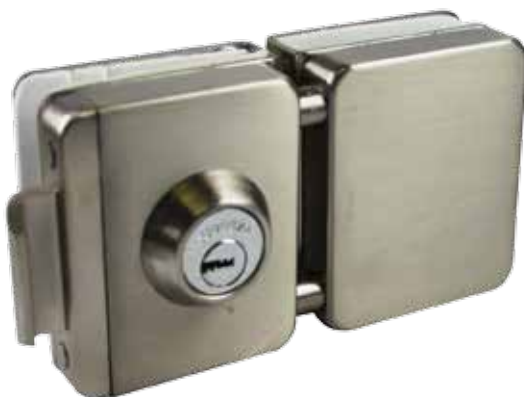
玻璃鎖牌(雙門) Patch Lock, Both Sides