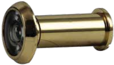
門眼(銅拋光) Door Viewer, Polished Brass Finish