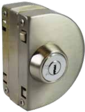
玻璃鎖(單邊) Patch Lock, Single Side