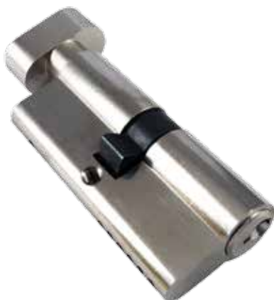
70MM手扭葫蘆膽，工程用0號珠(沙鍍色) Euro Profile Cylinder and Turn, Satin Nickel Finish