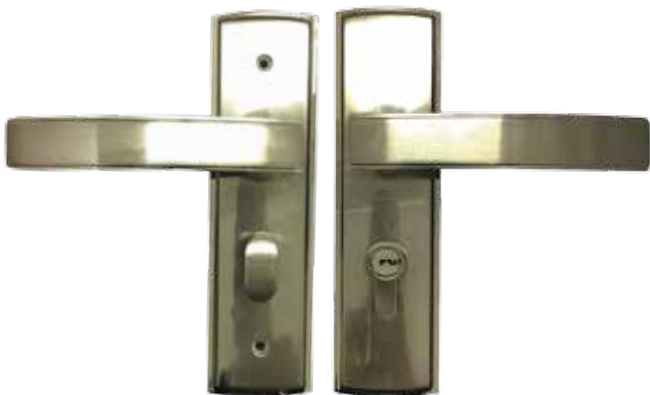
插芯鎖(沙鐳色) Lever Lock Set, Satin Nickel Finish