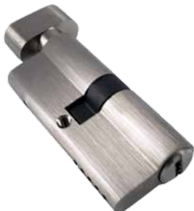
70MM雙排珠電腦匙手扭葫蘆膽(沙鍍色) Euro Profile Cylinder and Turn, Satin Nickel Finish