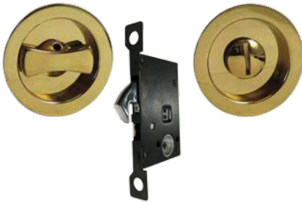
圓形趟門勾鎖(金色) Sliding Door Privacy Lock (Gold)