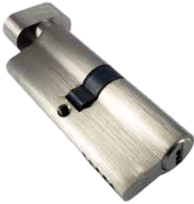
80MM雙排珠電腦匙手扭葫蘆膽(沙鍍色) Euro Profile Cylinder and Turn, Satin Nickel Finish