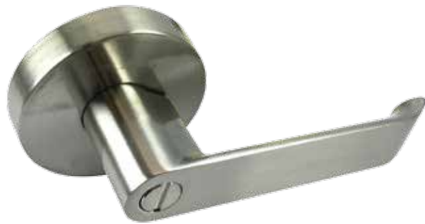
重裝三桿鎖(沙鐳色) Key-In Lever Set, Privacy Function, Satin Nickel Finish