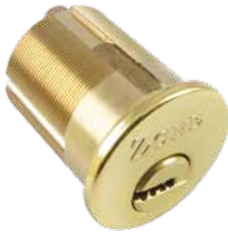
38mm雙排珠電腦匙螺絲膽(銅拋光) Screw-In Cylinder, Polished Brass Finish