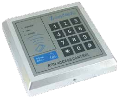
拍卡密碼制盤(跟卡五張) Card Reader with Pins