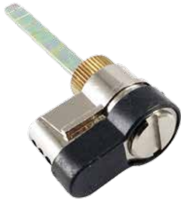
插芯鎖膽(沙鐳色) Cylinder, Satin Nickel Finish