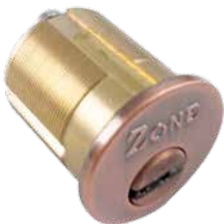
35MM電腦匙鑲絲膽(紅古) Screw-In Cylinder, Antique Copper Finish