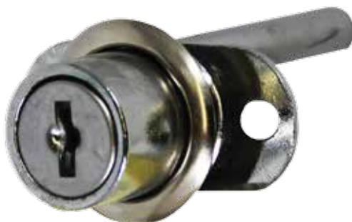
DIAGO 16MM正面三聯鎖 Cabinet Lock