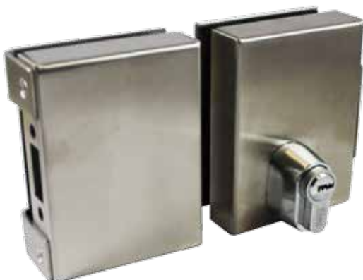
玻璃門鎖(雙門) Patch Lock, Both Sides