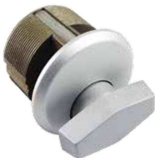
29MM鋅合金手扭鑲絲膽(沙鍍色) Screw-In Thumb Turn, Satin Nickel Finish