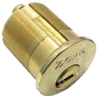
35MM電腦匙鑲絲膽 Screw in Cylinder with Dimple Key, Polished Brass Finish