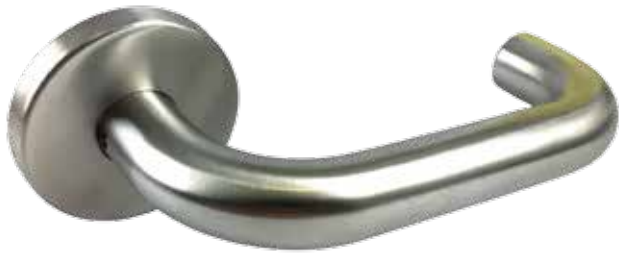
19MM不銹鋼手抽(沙鋼色) C Lever Handle, Satin S.S. Finish