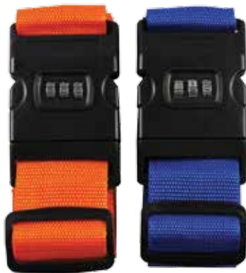
旅行帶 Luggage Belt