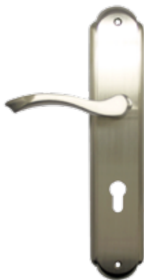
圓型不銹鋼面板套裝，未計鎖膽及鎖體 SS Handle Set, Without Lockcase and Cylinders