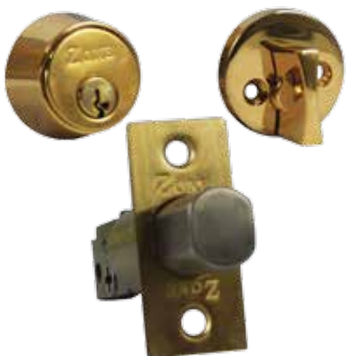
附加鎖套裝(沙金色) Cylinder with Flat Key Deadbolt Set, Satin Brass Finish