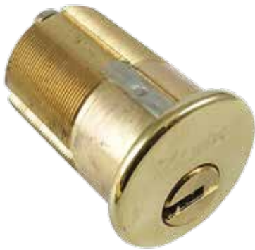
Z10 1'6/8螺絲膽(PVD) Screw-In Cylinder, PVD Finish