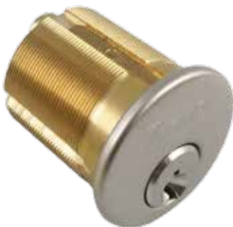
35MM普通匙螺絲膽(沙鍍色) Screw-In Cylinder, Satin Nickel Finish