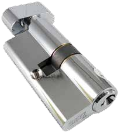
65MM手扭葫蘆膽(光叻色) Euro Profile Cylinder and Turn, Polished Chrome Finish