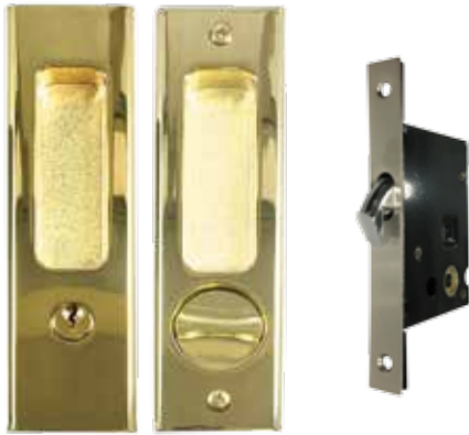
趟門勾鎖(金色) Sliding Door Lock (Gold)