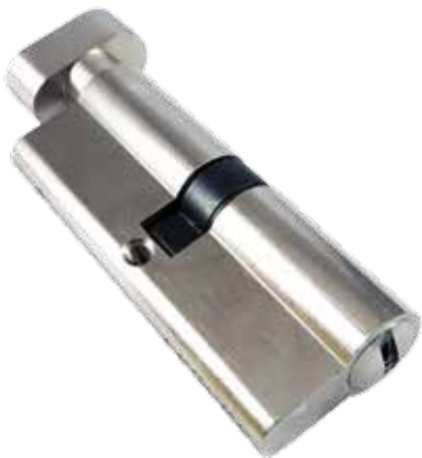
80MM電腦匙手扭葫蘆膽(沙鍍色) Euro Profile Cylinder and Turn with Dimple Key, Satin Nickel Finish