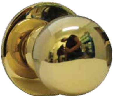
扁球門鎖，通道(銅拋光色) Passage Knob, Polished Brass Finish