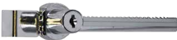
DIAGO 玻璃鎖 Glass Lock