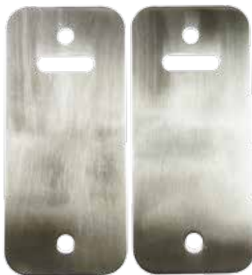
不銹鋼鎖面板 Satin S.S. Plate