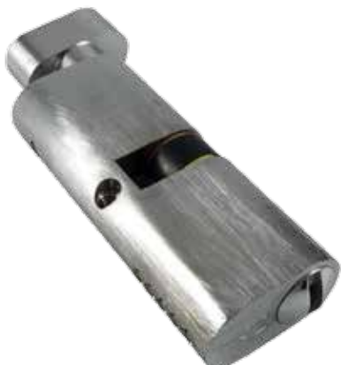
76MM電腦匙手扭大鵝蛋 Oval Profile Cylinder and Turn, Satin Chrome Finish