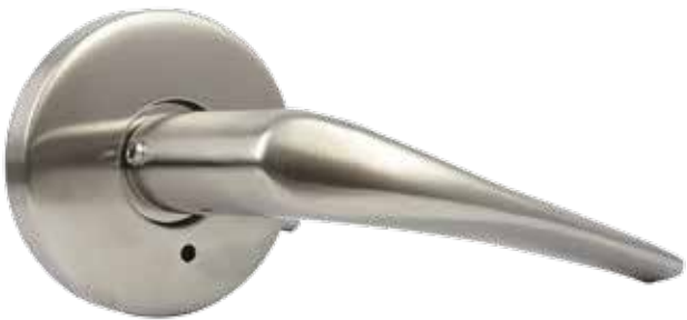
不銹鋼手抽(沙鋼色) Lever Handle, Satin S.S. Finish