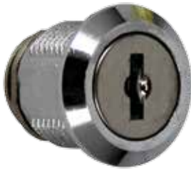
DIAGO 16MM信箱鎖 Cabinet Lock