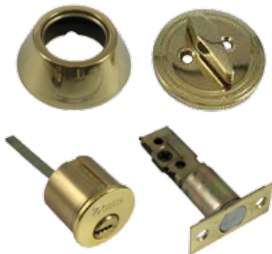
雙排珠電腦匙 (附加膽)套裝(銅拋光) Cylinder with Dimple Key Deadbolt Set, Polished Brass Finish