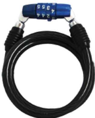
威也密碼鎖 Wire Loop with Combination Lock