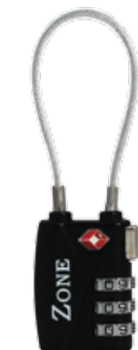
TSA 威也合金密碼鎖 Combination Lock with Wire Loop