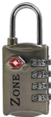
TSA 28MM 密碼鎖 Combination Lock