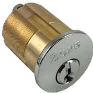
38MM普通匙螺絲膽(光叻) Screw-In Cylinder, Polished Chrome Finish