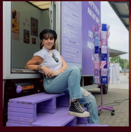
ELINE Bo Diversity