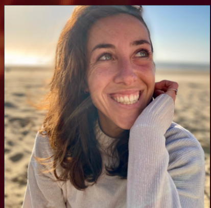
JESKE Music Moves NL