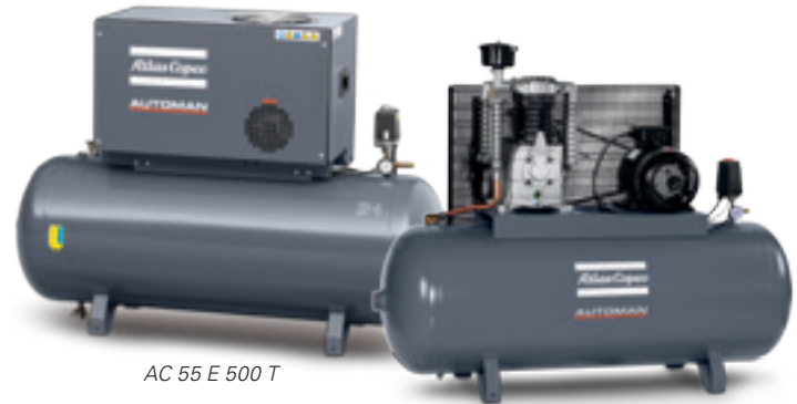
AC 55 E 500 T