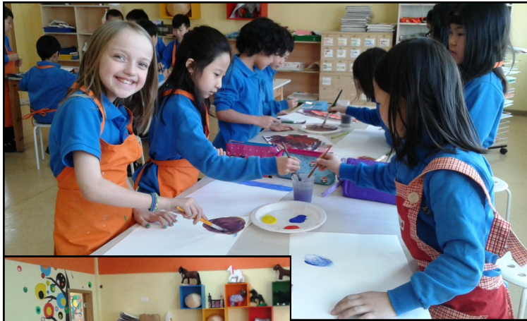
Left and above: Grade 2 students are creating secondary and complementary colors from the primary colors: blue, red, and yellow.

In elementary school, students are introduced to the elements and principles of art, to famous artists, and have opportunity to complete a variety of art projects. I think our program of art education and exposure promotes self-directed learning, improves school attendance, and sharpens critical and creative skills. I cannot offer objective studies to back up my thinking