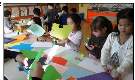
Kindergarten students are cutting out colored paper to create images.