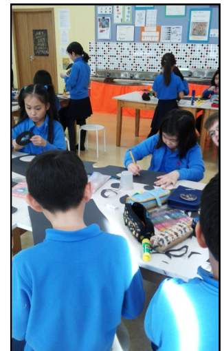
Grade 3 students are working with construction and tissue papers to make flowers.