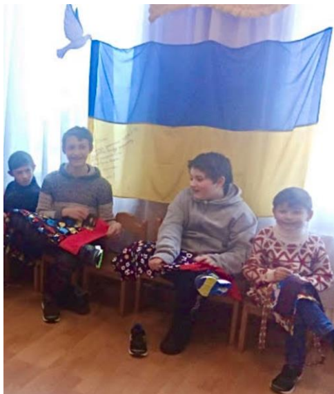
Children of the 645 m 2 of the preschool educational institution (orphanage) "Snowdrop" in the Lviv Region

These repairs will enable the orphanage to now focus on additional internal repairs that need to be completed, including work on the boiler units. While our mission focus is primarily focused on serving the Allegheny Valley, we found it a privilege to serve the children of Ukraine by providing support for roof repairs along with sharing messages of hope and support. We desire to continue relationships into the future with the orphanage and its children and to see them grow in a safe and healthy environment. Currently, we are in collaborative efforts with St. Vladimir Ukrainian Church to create an Easter raffle that will continue to benefit the orphanage and their efforts to replace a boiler system. Please stay tuned to more details on our website at www.habitatav.org .