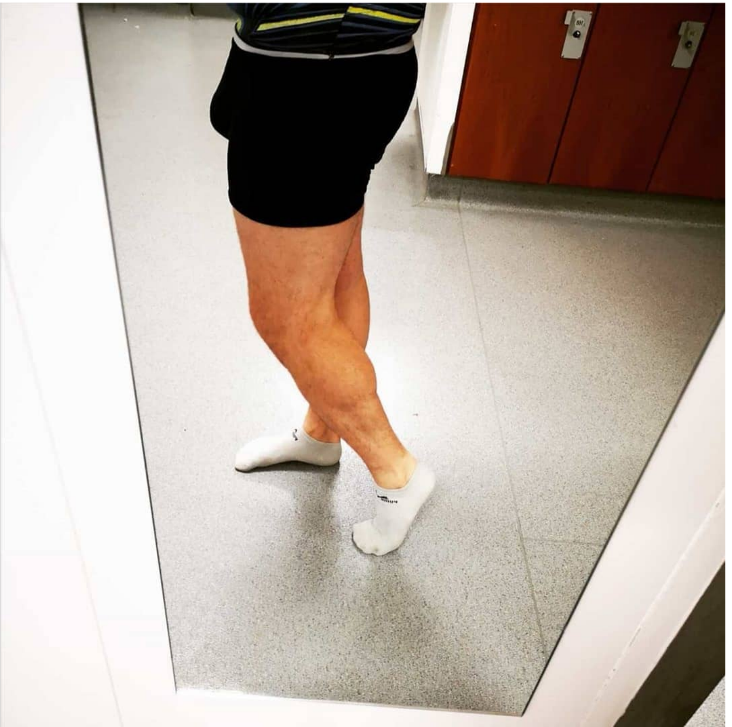
throwback All india selection trial 200m @ajitsingh200mt #runningmanchallenge #fitness #speed #love #training #fit #gymselfies#runningmotivation #trackandfield #tracknation #athlete #ahleta #athleisure #athletes #athletic #beastmood #100m#200m#nevergiveup #2019bestnine 640